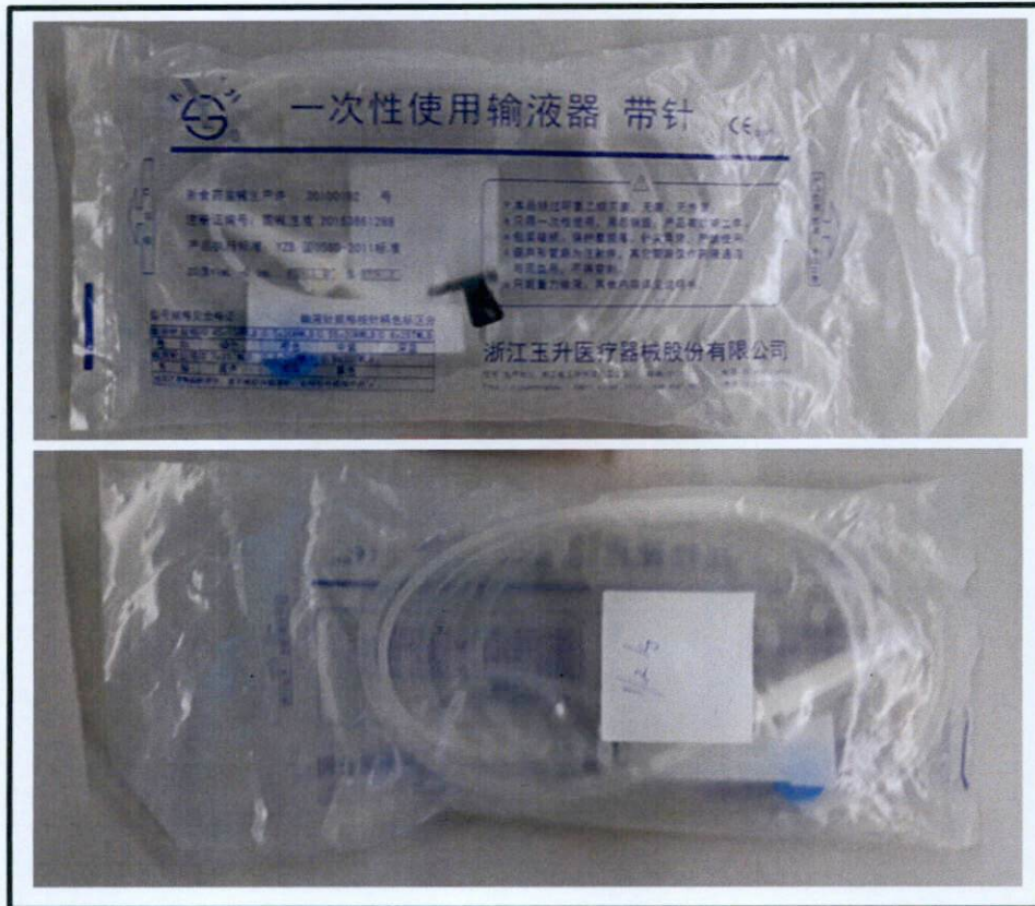
Figure 1. Unregistered “Disposable Infusion Set With Needle (in Foreign Characters)”

The Food and Drug Administration (FDA) warns all healthcare professionals and the general public NOT TO PURCHASE AND USE the unregistered medical device product: