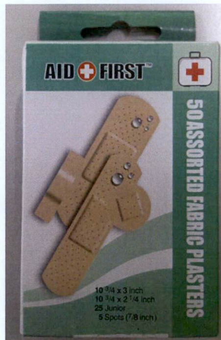
Figure 1. Unnotified Aid First – 50 Assorted Fabric Plaster

The Food and Drug Administration (FDA) warns all healthcare professionals and the general public NOT TO PURCHASE AND USE the unnotified medical device product: