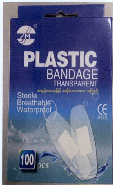
Figure 1. Unnotified /M® Plastic Bandage Transparent – Sterile Breathable Waterproof

The Food and Drug Administration (FDA) warns all healthcare professionals and the general public NOT TO PURCHASE AND USE the unnotified medical device product: