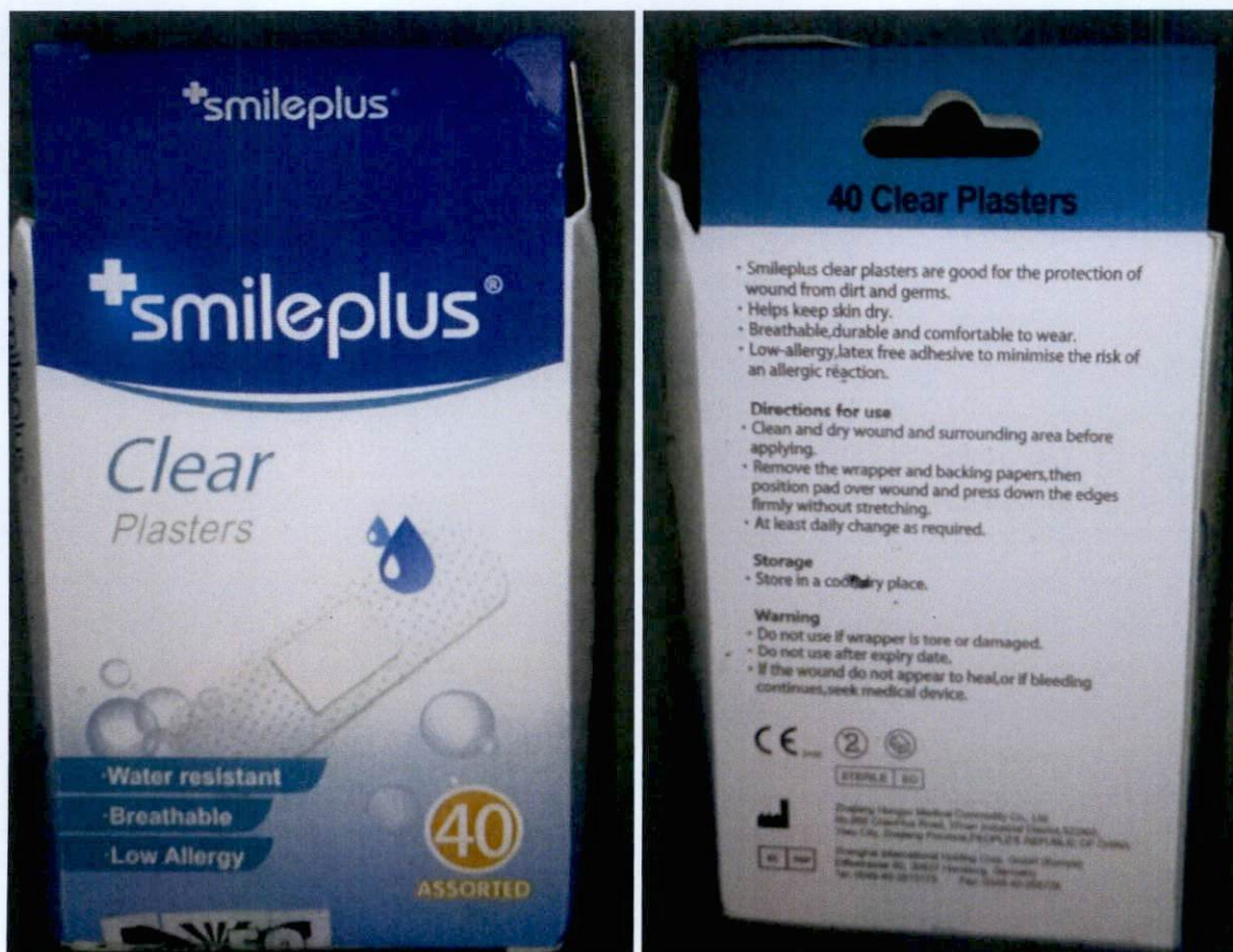
Figure 1. Unnotified Smileplus Clear Plasters

The Food and Drug Administration (FDA) warns all healthcare professionals and the general public NOT TO PURCHASE AND USE the unnotified medical device product: