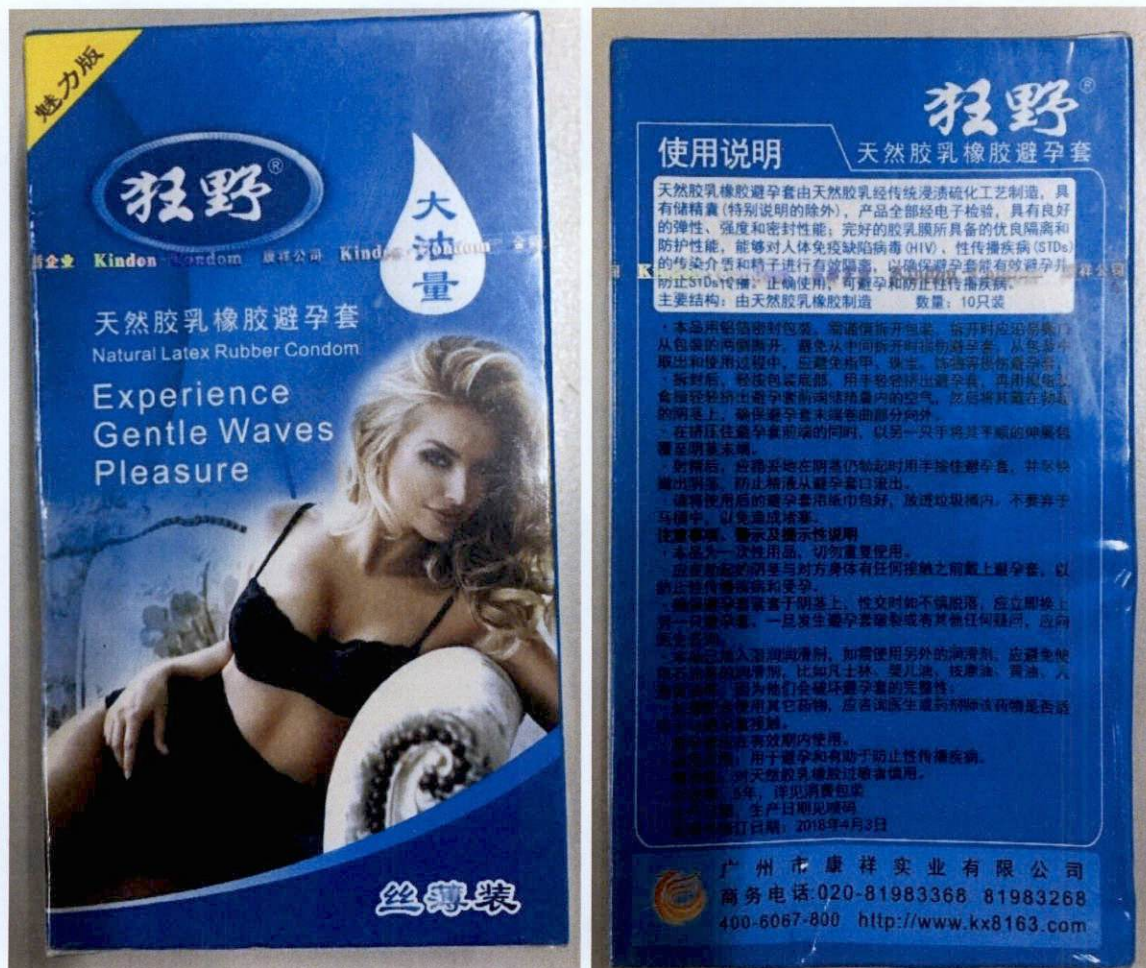
Figure 1. Unregistered Natural Latex Rubber Condom (In Foreign Characters)

The Food and Drug Administration (FDA) warns all healthcare professionals and the general public NOT TO PURCHASE AND USE the unregistered medical device product: