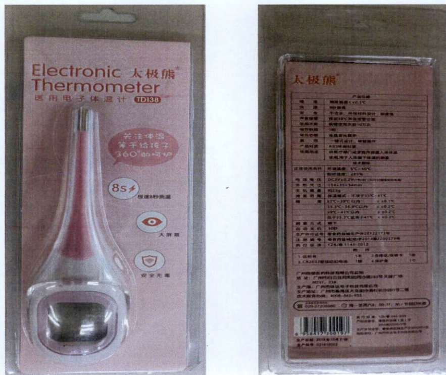
Figure 1. Unregistered Electronic Thermometer TD138

The Food and Drug Administration (FDA) warns all healthcare professionals and the general public NOT TO PURCHASE AND USE the unregistered medical device product: