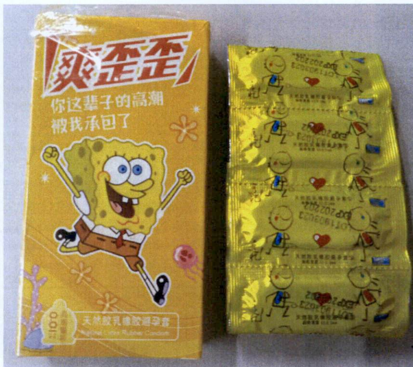
Figure 1. Unregistered Natural Latex Rubber Condom In Foreign Characters

The Food and Drug Administration (FDA) warns all healthcare professionals and the general public NOT TO PURCHASE AND USE the unregistered medical device product: