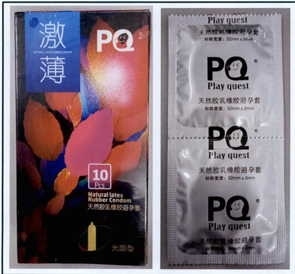
Figure 1. Unregistered "PQ Play Quest Natural Latex Rubber Condom"

The Food and Drug Administration (FDA) warns all healthcare professionals and the general public NOT TO PURCHASE AND USE the unregistered medical device product: