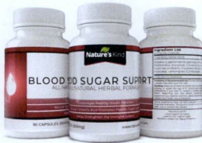
Figure 4. Unregistered NATURE'S KIND Blood Sugar Support Capsules