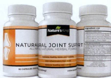
Figure 5. Unregistered NATURE'S KIND Natural Joint Support Capsules