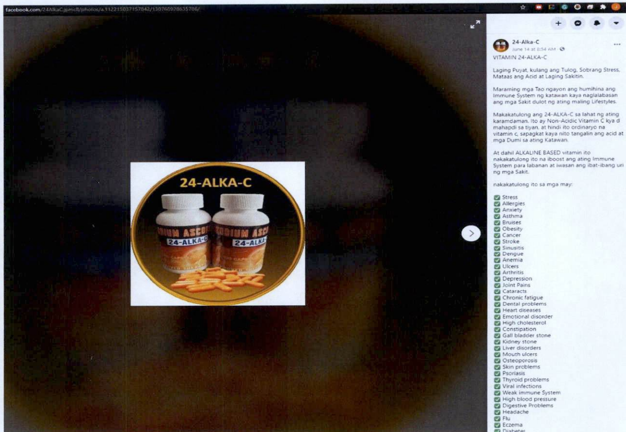
Figure 1. Unregistered 24 ALKA-C Sodium Ascorbate

The Food and Drug Administration (FDA) warns all healthcare professionals and the general public NOT TO PURCHASE AND CONSUME the following unregistered food supplements: