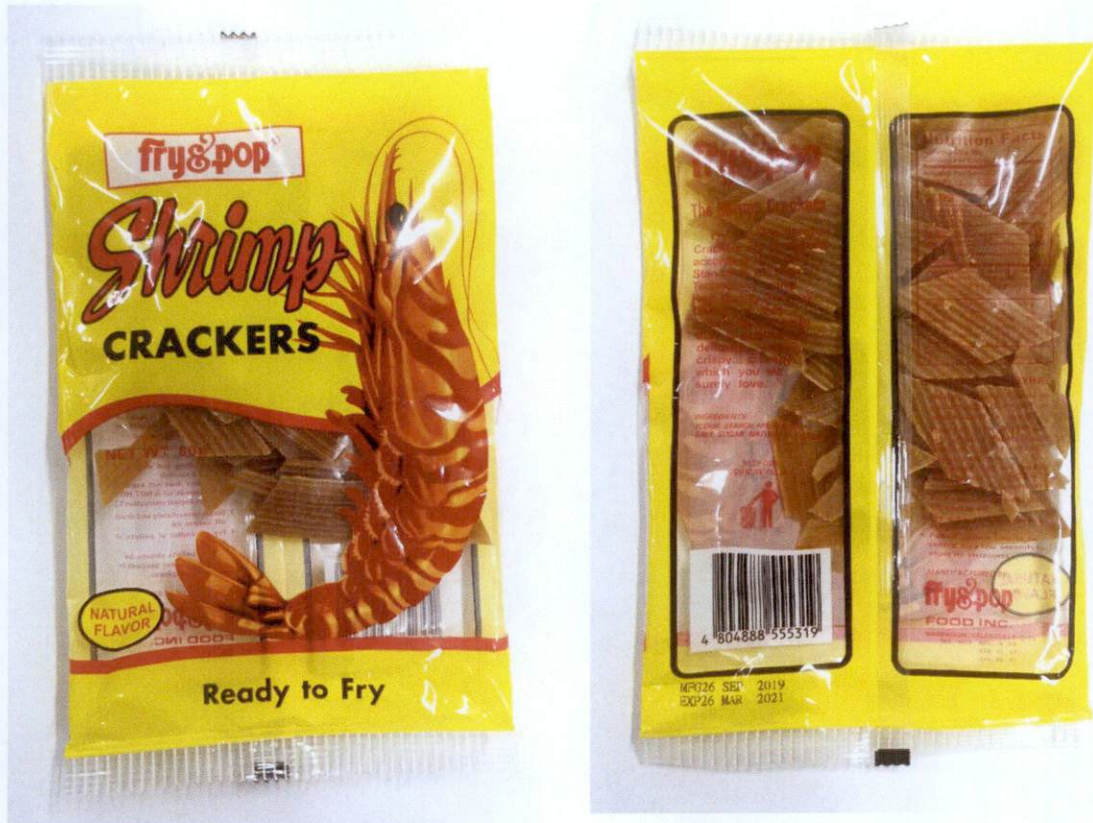
Figure 4. Unregistered FRY & POP Shrimp Crackers – Natural Flavor

The FDA verified through post-marketing surveillance that the abovementioned food products and food supplement are not registered and no corresponding Certificates of Product Registration (CPR) have been issued. Pursuant to the Republic Act No. 9711, otherwise known as the “Food and Drug Administration Act of 2009”, the manufacture, importation, exportation, sale, offering for sale, distribution, transfer, non-consumer use, promotion, advertising or sponsorship of health products without the proper authorization is prohibited.