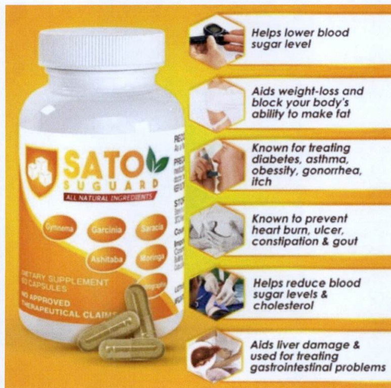
Figure 1. Unregistered SATO Suguard Dietary Supplements

The Food and Drug Administration (FDA) warns all healthcare professionals and the general public NOT TO PURCHASE AND CONSUME the following unregistered food supplements and food products: