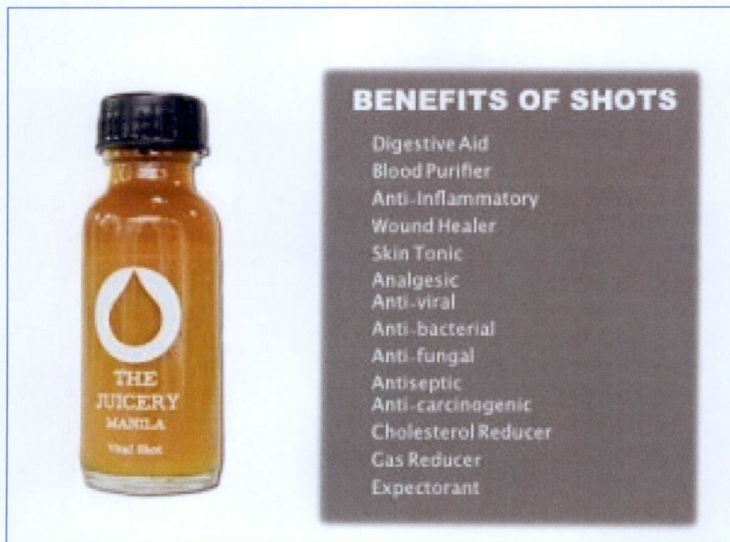
Figure 3. Unregistered THE JUICERY MANILA Vital Shot