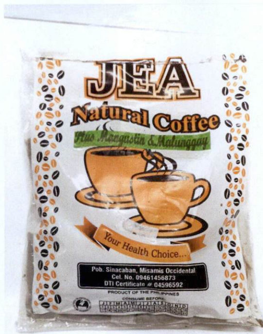
Figure 1. Unregistered JEA Natural Coffee Plus Mangustin & Malunggay

The Food and Drug Administration (FDA) warns all healthcare professionals and the general public NOT TO PURCHASE AND CONSUME the following unregistered food products: