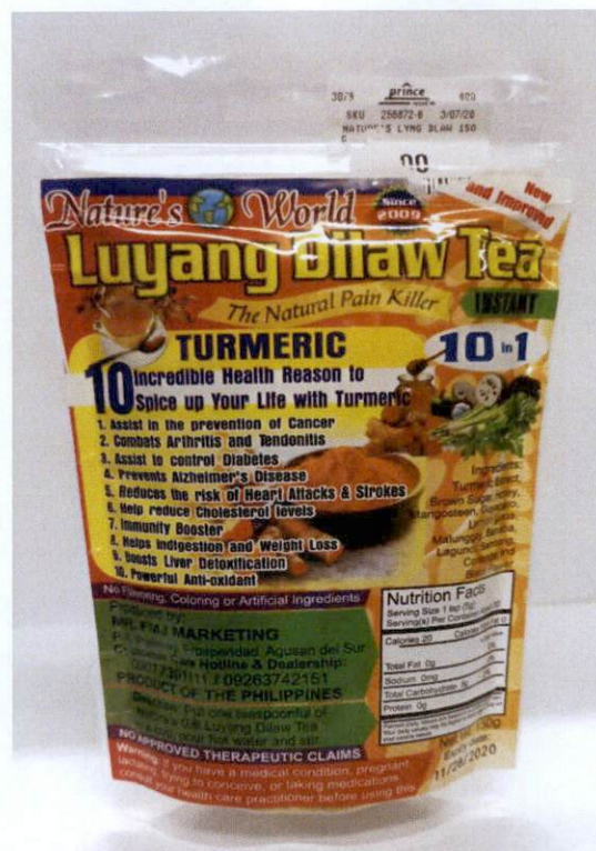
Figure 3. Unregistered NATURE'S WORLD 10-in-1 Luyang Dilaw Tea