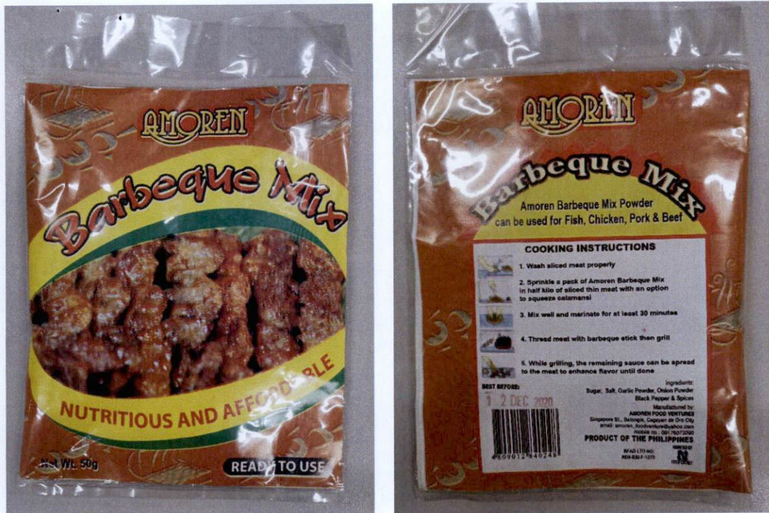
Figure 2. Unregistered AMOREN Barbeque Mix Powder