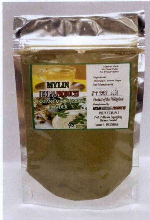
Figure 5. Unregistered MYLIN HERBAL PRODUCTS Instant Malunggay Powder