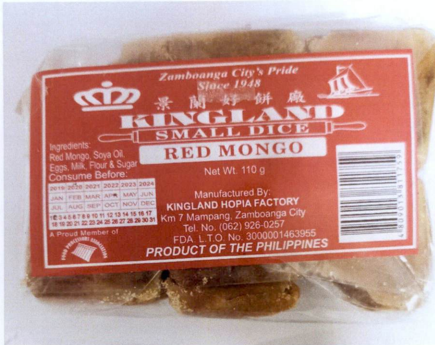
Figure 4. Unregistered KINGLAND Small Dice Red Mongo