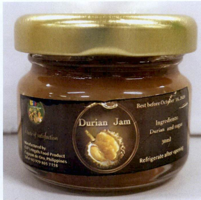
Figure 4. Unregistered GTF'S Durian Jam

The FDA verified through post-marketing surveillance that the abovementioned food products are not registered and no corresponding Certificates of Product Registration (CPR) have been issued. Pursuant to the Republic Act No. 9711, otherwise known as the “Food and Drug Administration Act of 2009”, the manufacture, importation, exportation, sale, offering for sale, distribution, transfer, non-consumer use, promotion, advertising or sponsorship of health products without the proper authorization is prohibited.