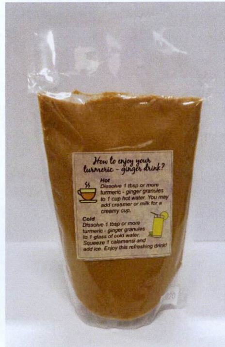
Figure 3. Unregistered MOUNTAIN'S GIFT Turmeric Ginger