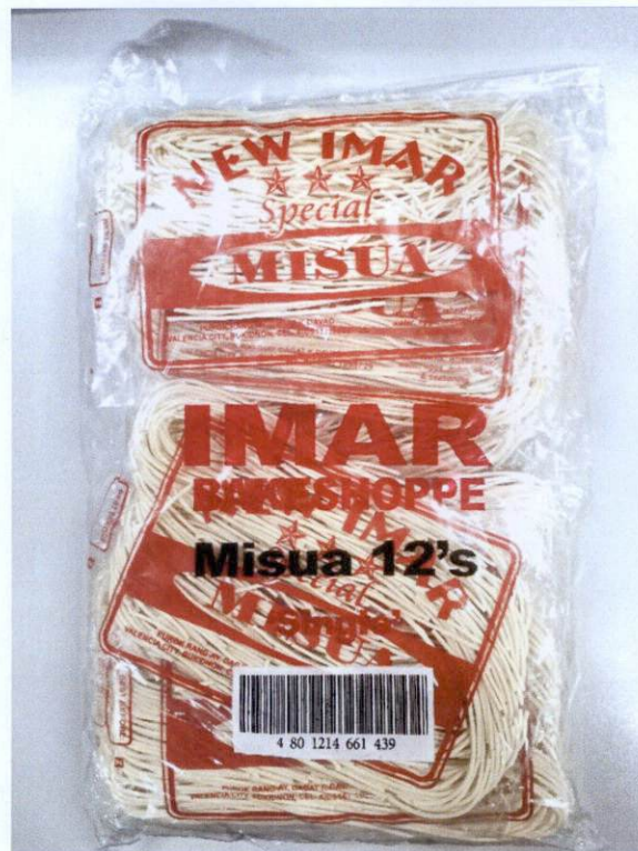
Figure 1. Unregistered NEW IMAR Special Misua

The Food and Drug Administration (FDA) warns all healthcare professionals and the general public NOT TO PURCHASE AND CONSUME the following unregistered food products: