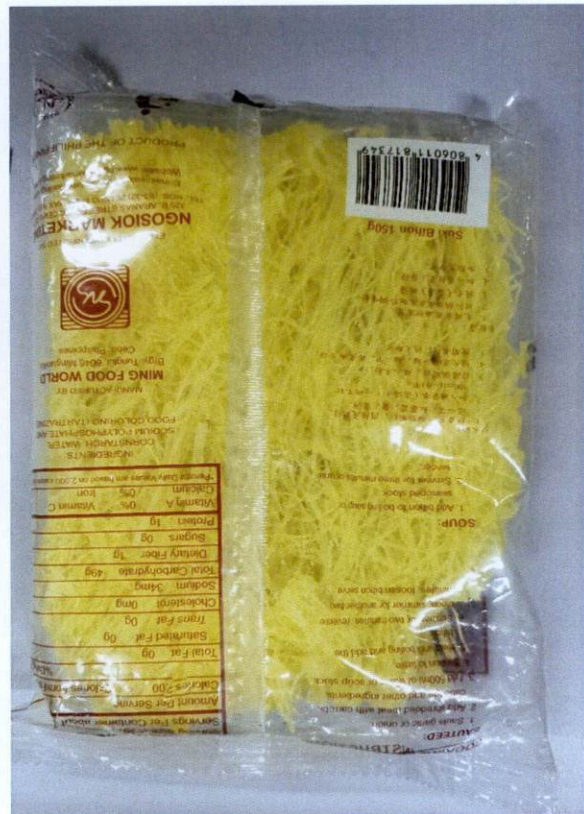
Figure 2. Unregistered SUKI Bihon