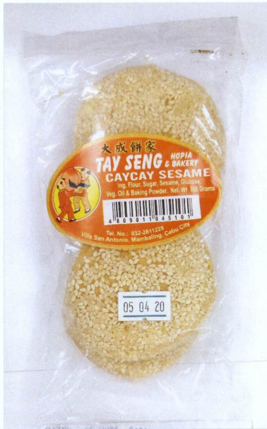
Figure 2. Unregistered TAY SENG & HOPIA BAKERY Caycay Sesame