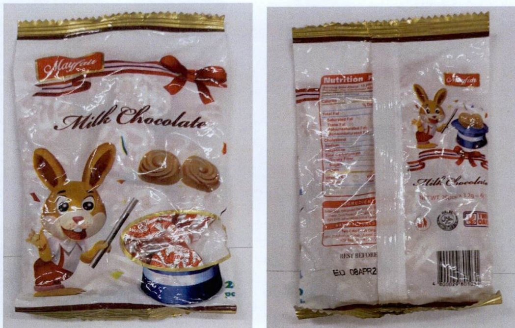
Figure 5. Unregistered MAYFAIR Milk Chocolate