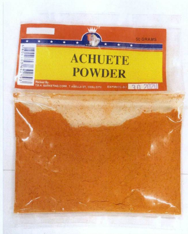
Figure 1. Unregistered Achuete Powder

The Food and Drug Administration (FDA) warns all healthcare professionals and the general public NOT TO PURCHASE AND CONSUME the following unregistered food products: