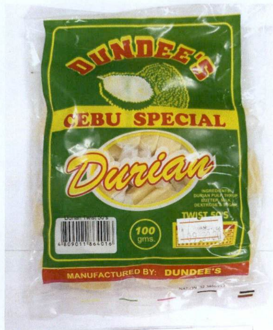
Figure 3. Unregistered DUNDEE'S CEBU SPECIAL Durian