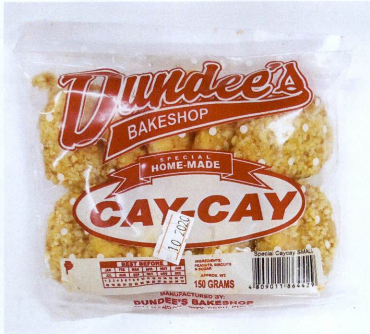
Figure 4. Unregistered DUNDEE'S BAKESHOP Special Home-made Caycay