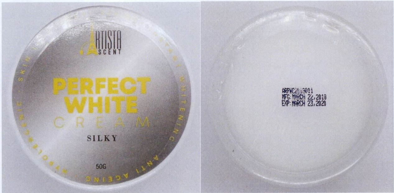
Figure 1. Counterfeit Artista Scent Perfect White Cream Silky

The Food and Drug Administration (FDA) warns the public from purchasing and using the below counterfeit cosmetic product: