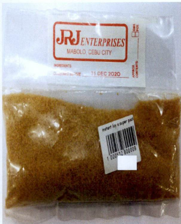
Figure 2. Unregistered JRJ ENTERPRISES Instant Luy A Super Pack