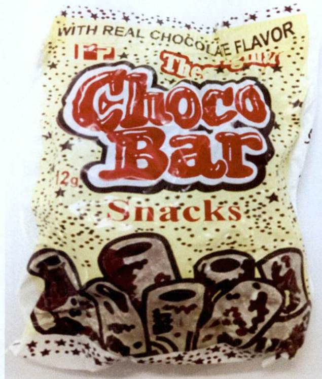
Figure 1. Unregistered CHOCO BAR Snacks - The Original with Real Chocolate Flavor, 12g

The Food and Drug Administration (FDA) warns all healthcare professionals and the general public NOT TO PURCHASE AND CONSUME the following unregistered food products: