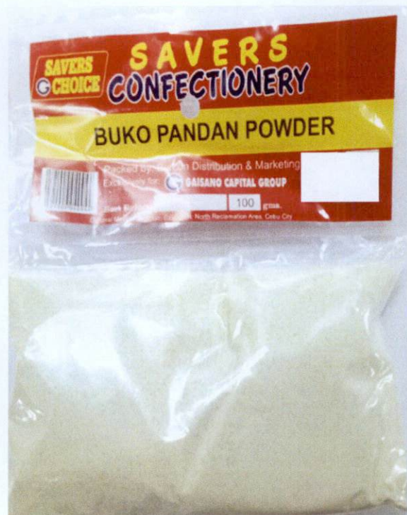
Figure 5. Unregistered SAVERS CHOICE Buko Pandan Powder, 100gms.