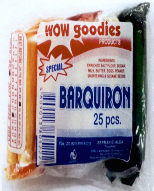
Figure 4. Unregistered WOW GOODIES PRODUCTS Special Barquiron, 25 Pcs