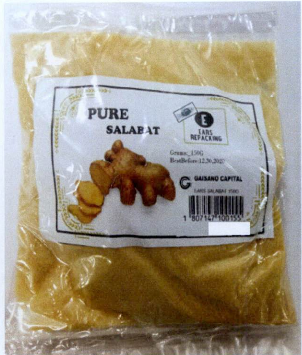
Figure 3. Unregistered EARS REPACKING Pure Salabat, 150g