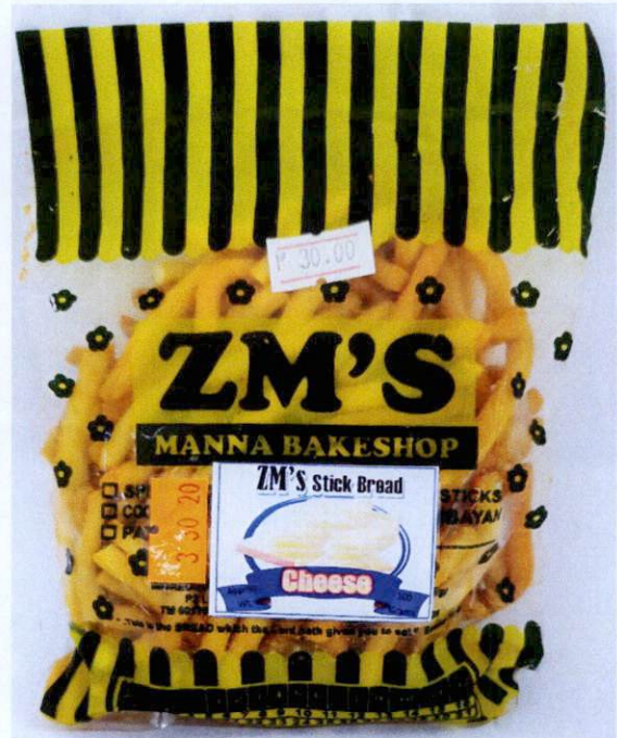
Figure 5. Unregistered ZM'S MANNA BAKESHOP Stick Bread Cheese