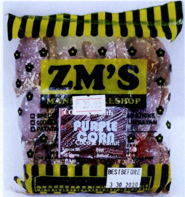
Figure 3. Unregistered ZM'S MANNA BAKESHOP Purple Corn