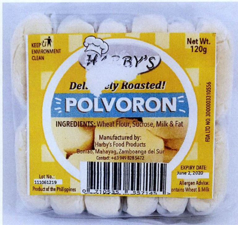
Figure 1. Unregistered HARBY'S Polvoron

The Food and Drug Administration (FDA) warns all healthcare professionals and the general public NOT TO PURCHASE AND CONSUME the following unregistered food products: