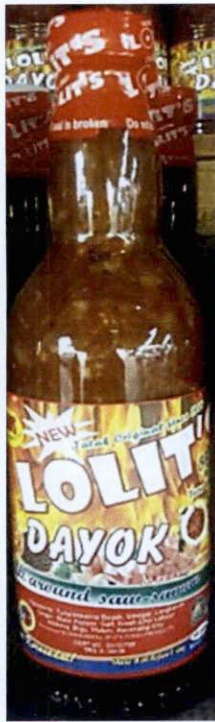
Figure 2. Unregistered LOLIT'S Dayok