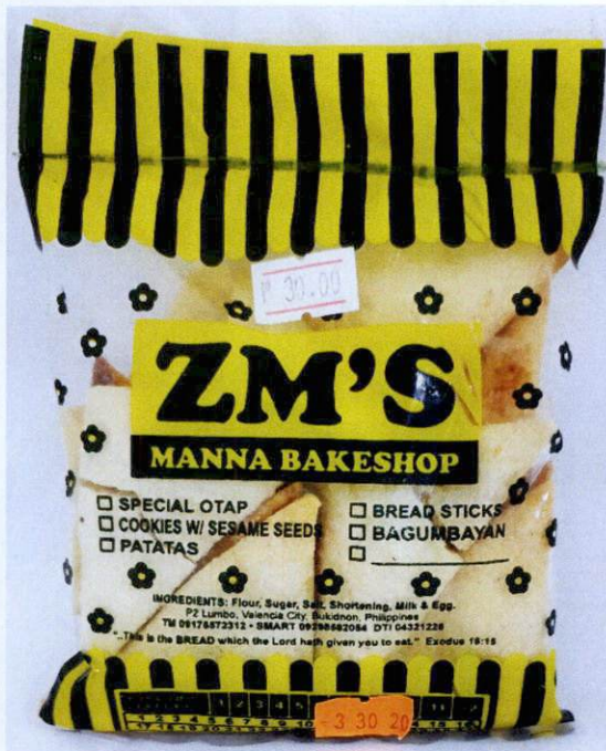
Figure 4. Unregistered ZM'S MANNA Patatas