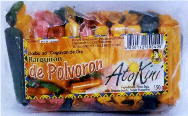
Figure 2. Unregistered GARBO SA CAGAYAN DE ORO ATO KINI Barquiron de Polvoro