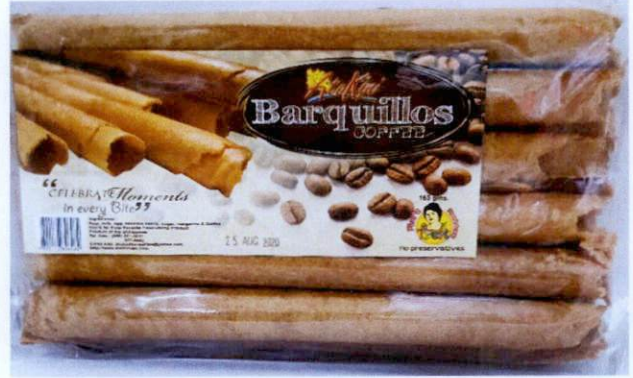
Figure 3. Unregistered GARBO SA CAGAYAN DE ORO ATO KINI Barquillos Coffee