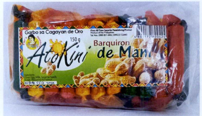
Figure 5. Unregistered GARBO SA CAGAYAN DE ORO ATO KINI Barquiron de Mani