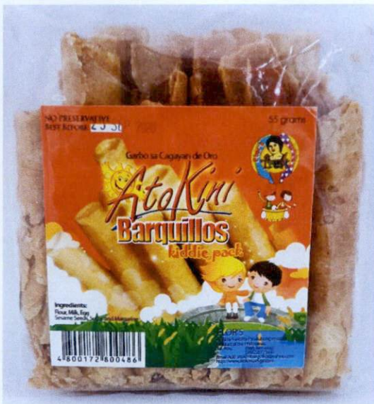
Figure 4. Unregistered GARBO SA CAGAYAN DE ORO ATO KINI Barquillos Kiddie Pack