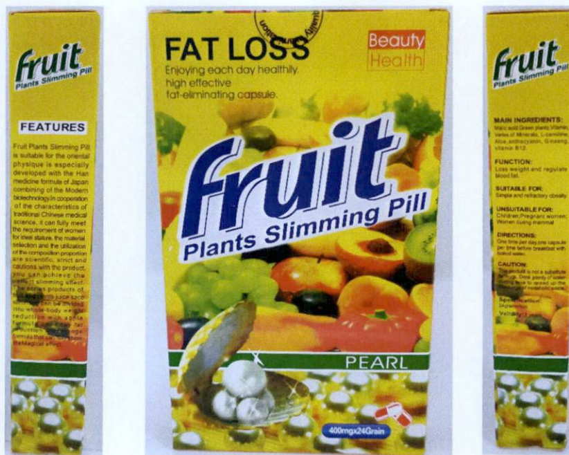
Figure 1. Unregistered BEAUTY HEALTH Fat Loss Fruit Plants Slimming Pills

The Food and Drug Administration (FDA) warns all healthcare professionals and the general public NOT TO PURCHASE AND CONSUME the following unregistered food supplement and food products: