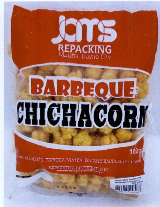
Figure 3. Unregistered JAM'S REPACKING Barbeque Chichacorn