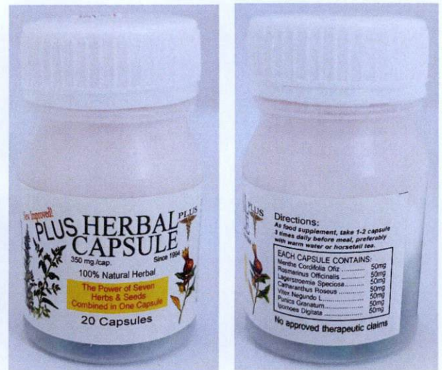
Figure 5. Unregistered PLUS Herbal Capsule