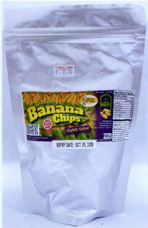
Figure 2. Unregistered PVL Green Banana Chips Slightly Salted