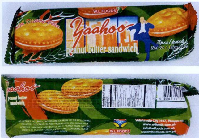
Figure 4. Unregistered W.L. YAAHOO Peanut Butter Sandwich