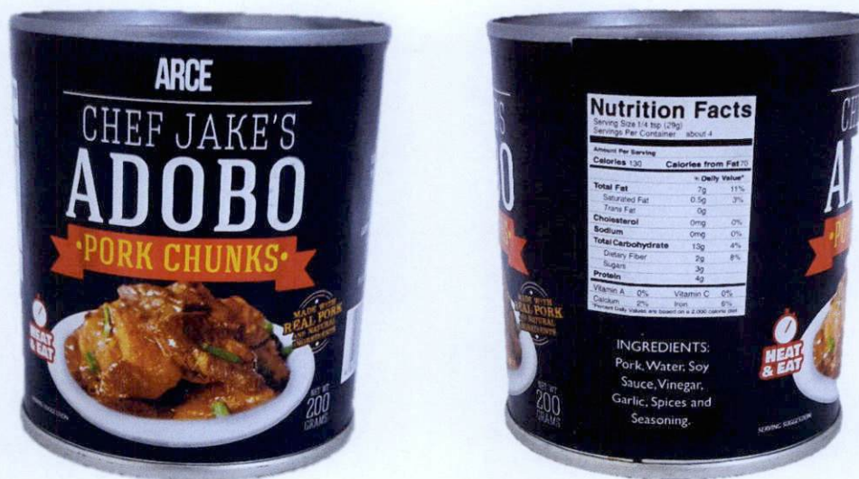
Figure 1. Unregistered ARCE CHEF JAKE'S Adobo Pork Chunks

The Food and Drug Administration (FDA) warns all healthcare professionals and the general public NOT TO PURCHASE AND CONSUME the following unregistered food products and food supplement: