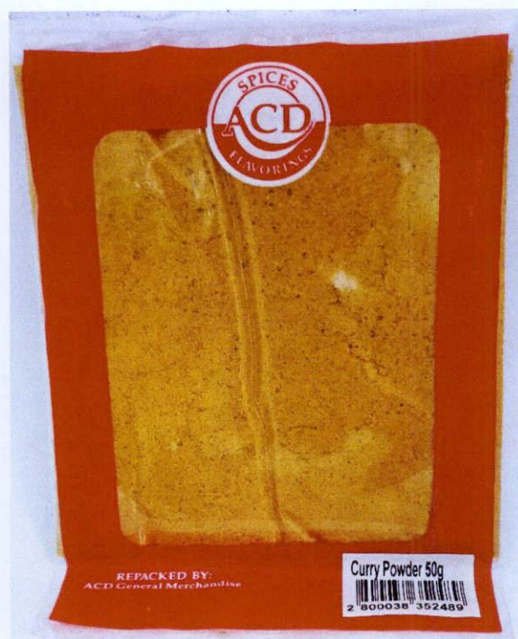
Figure 3. Unregistered SPICES ACD FLAVORINGS Curry Powder