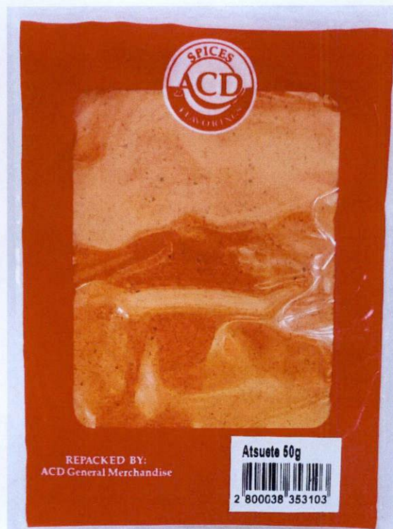
Figure 5. Unregistered SPICES ACD FLAVORINGS Atsuete