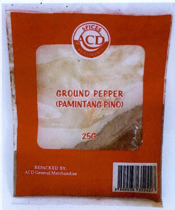
Figure 2. Unregistered SPICES ACD FLAVORINGS Ground Pepper Pamintang Pino