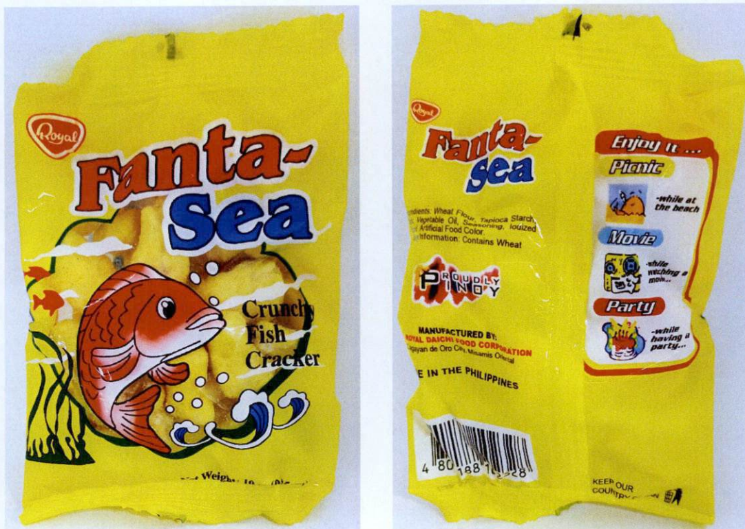
Figure 1. Unregistered ROYAL FANTA-SEA Crunchy Fish Cracker

The Food and Drug Administration (FDA) warns all healthcare professionals and the general public NOT TO PURCHASE AND CONSUME the following unregistered food products: