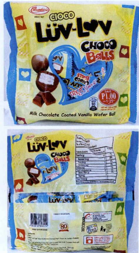
Figure 5. Unregistered COLUMBIA'S Cioco Luv-Lov Choco Balls Milk Chocolate Coated Vanilla Wafer Balls