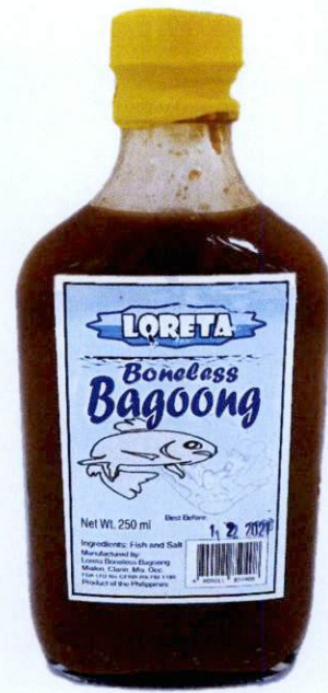
Figure 3. Unregistered LORETA Boneless Bagoong