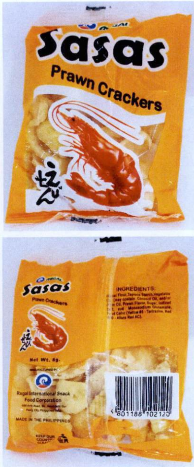
Figure 2. Unregistered REGAL SASAS Prawn Crackers