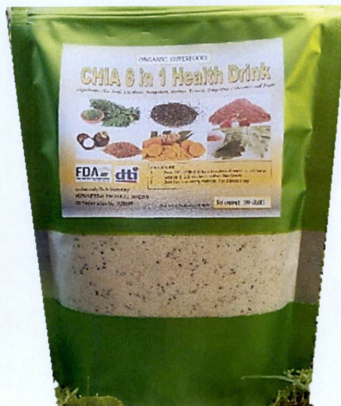
Figure 1. Unregistered Chia 8 in 1 Health Drink

The Food and Drug Administration (FDA) warns all healthcare professionals and the general public NOT TO PURCHASE AND CONSUME the following unregistered food products: