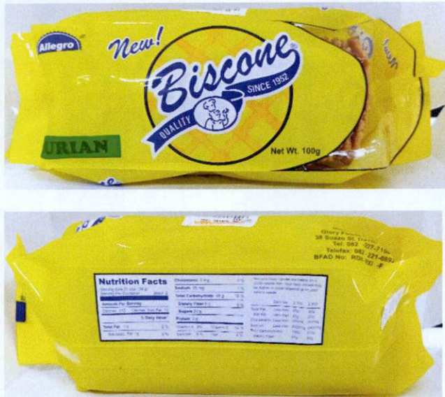
Figure 4. Unregistered ALLEGRO Biscone Durian