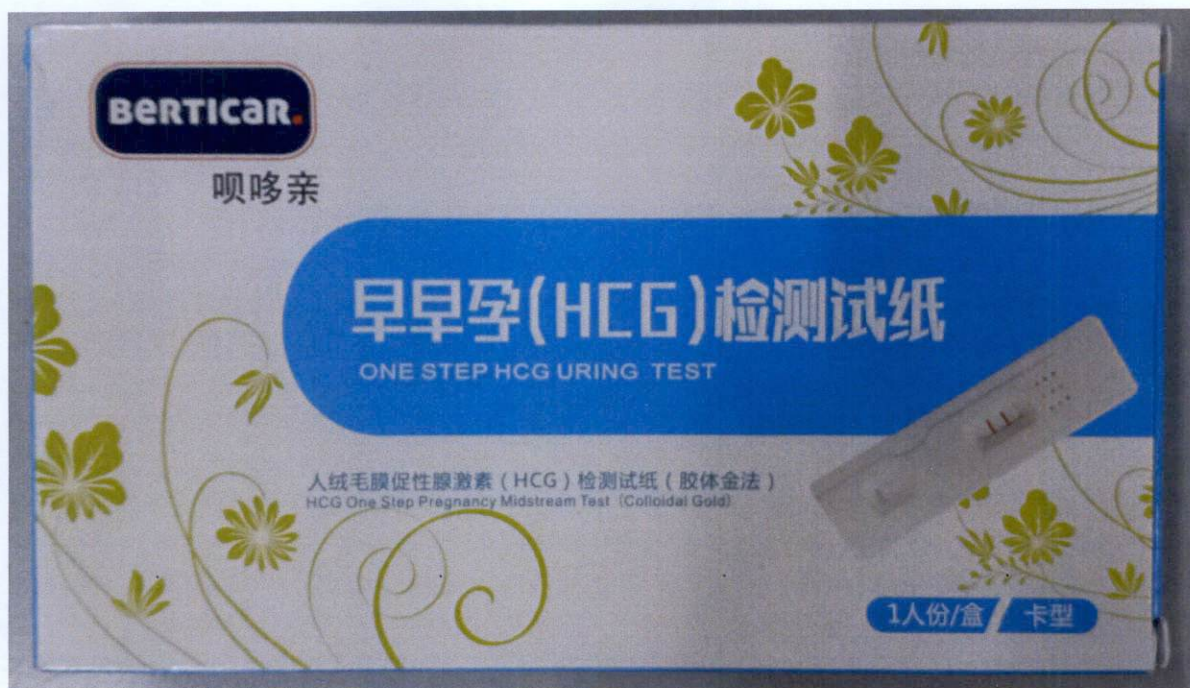
Figure 2. Unregistered Berticar® One Step HCG Urine Test

The Food and Drug Administration (FDA) warns all healthcare professionals and the general public NOT TO PURCHASE AND USE the unregistered medical device product: