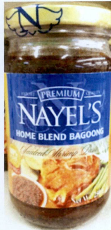
Figure 3. Unregistered PREMIUM NAYEL'S Home Blend Bagoong Sauteed Shrimp Paste