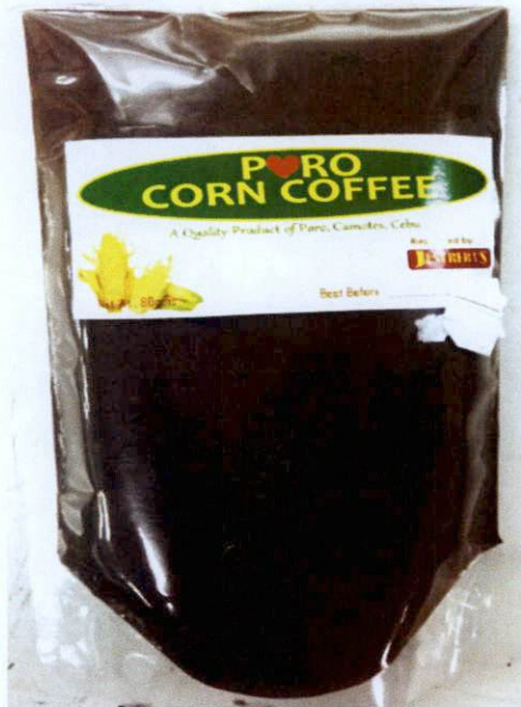
Figure 1. Unregistered JESTRERAS PORO Corn Coffee Powder, 80g

The Food and Drug Administration (FDA) warns all healthcare professionals and the general public NOT TO PURCHASE AND CONSUME the following unregistered food products: