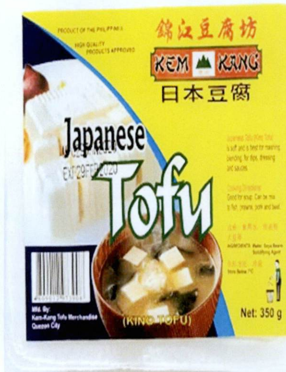
Figure 5. Unregistered KEM-KANG Japanese Tofu (Kino Tofu), Net Wt. 350g