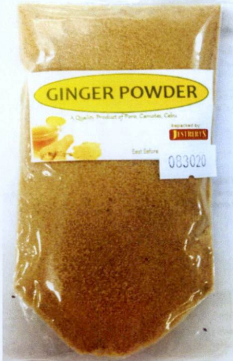
Figure 2. Unregistered (Unbranded) Ginger Powder, Net Wt. 80g