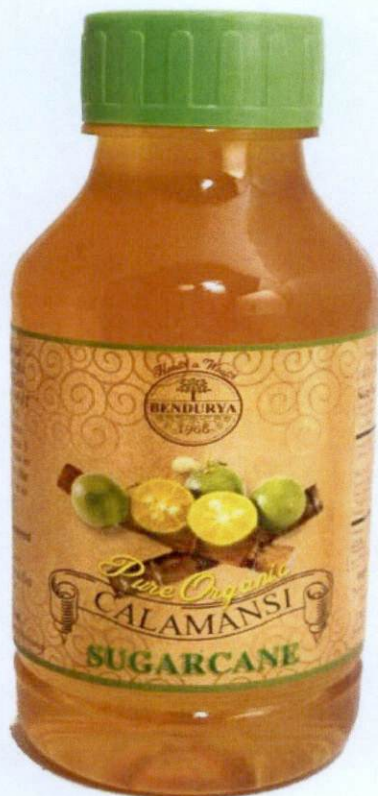
Figure 4. Unregistered BENDURYA Pure Organic Calamansi Sugarcane, 550ml