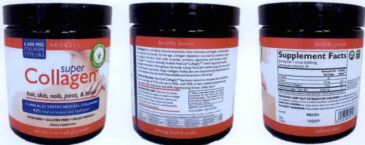
Figure 1. Unregistered NEOCELL Super Collagen Hair, Skin, Nails, Joints, & Bones 6600 mg Collagen Type 1 & 3 Dietary Supplement

The Food and Drug Administration (FDA) warns all healthcare professionals and the general public NOT TO PURCHASE AND CONSUME the following unregistered food supplement and food products: