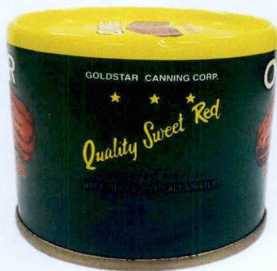
Figure 4. Unregistered OMOR Pimientos