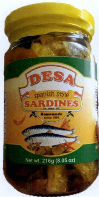
Figure 2. Unregistered DESA Spanish Style Sardines