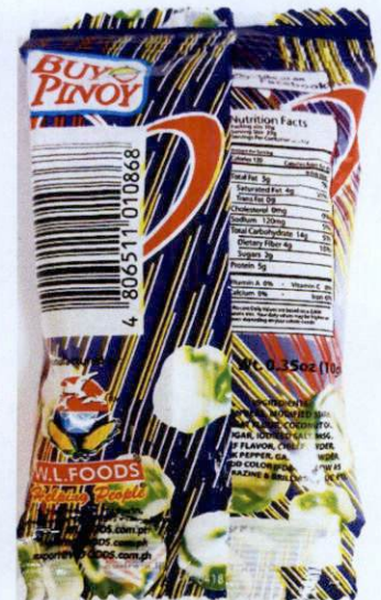
Figure 5. Unregistered W.L. LOTTO Coated Green Peas Beef Flavor