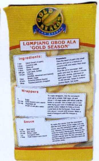
Figure 3. Unregistered GOLD SEASON Corn Starch