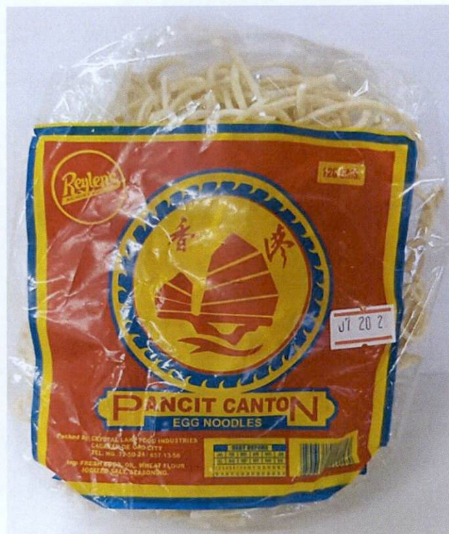
Figure 1. Unregistered REYLEN'S Pancit Canton Egg Noodles

The Food and Drug Administration (FDA) warns all healthcare professionals and the general public NOT TO PURCHASE AND CONSUME the following unregistered food products: