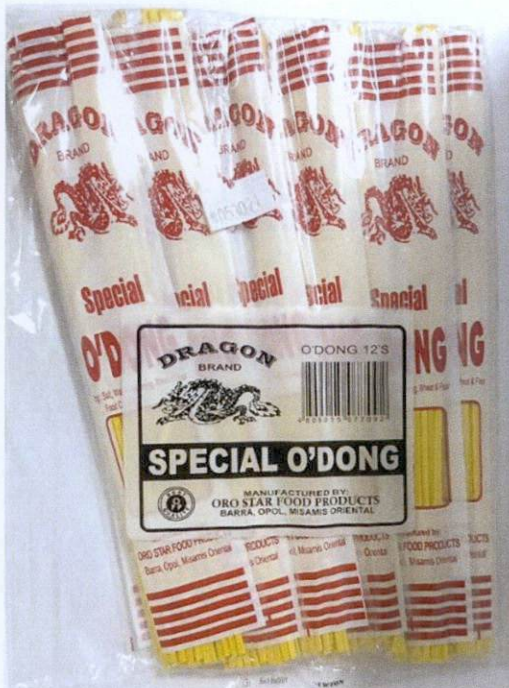
Figure 4. Unregistered DRAGON BRAND Special O'Dong