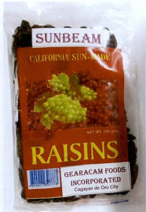
Figure 3. Unregistered SUNBEAM California Sun-Made Raisins