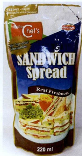
Figure 5. Unregistered MISTER CHEF'S Sandwich Spread Original