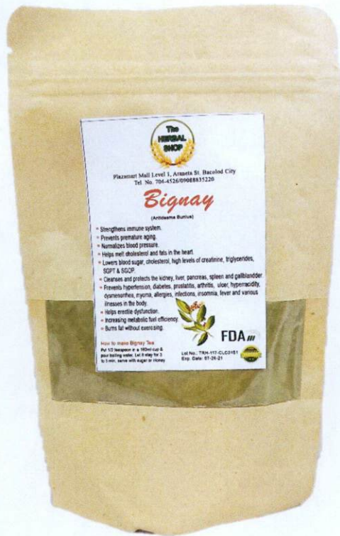
Figure 2. Unregistered THE HERBAL SHOP Bignay Powder