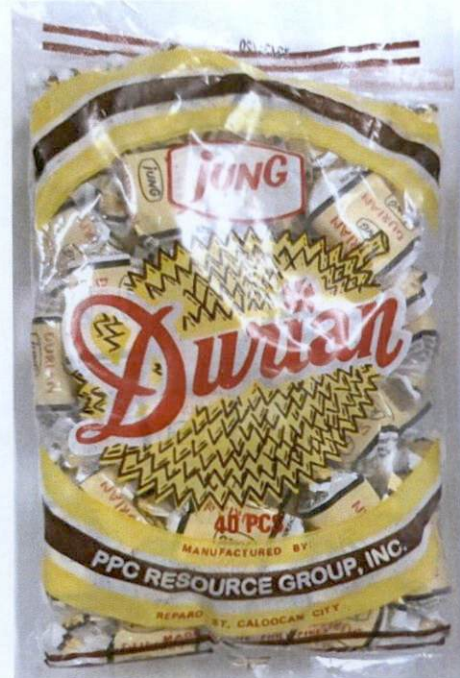
Figure 3. Unregistered JUNG Durian Candy