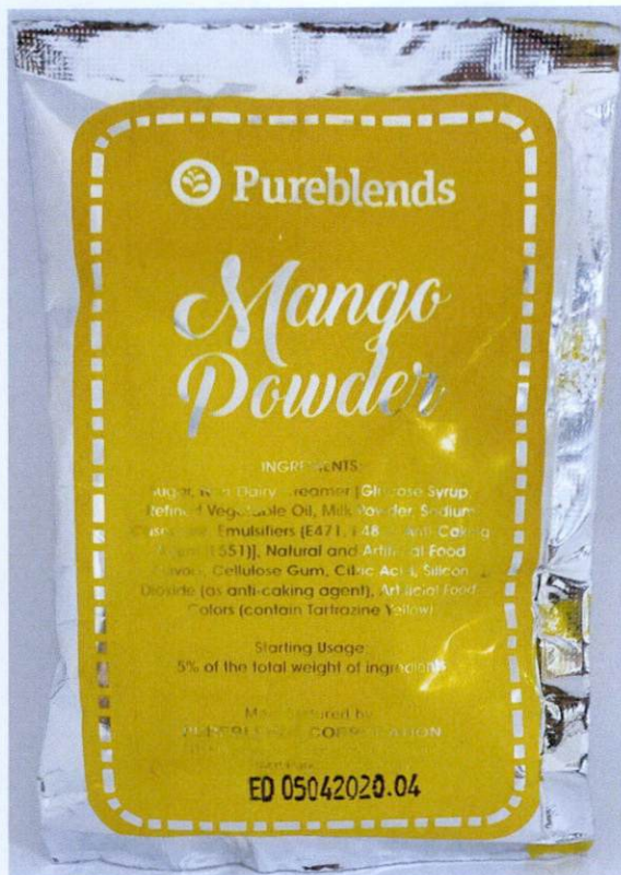
Figure 4. Unregistered PUREBLENDS Mango Powder