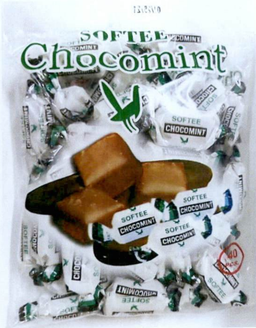
Figure 2. Unregistered SOFTEE Chocomint Candy