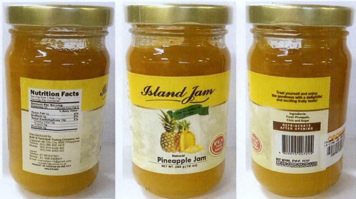
Figure 1. Unregistered ISLAND JAM Pineapple Jam

The Food and Drug Administration (FDA) warns all healthcare professionals and the general public NOT TO PURCHASE AND CONSUME the following unregistered food products: