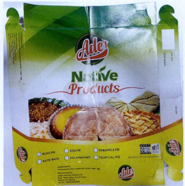
Figure 5. Unregistered ADE'S Native Products Buko Pie