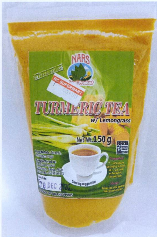
Figure 4. Unregistered NARS FOOD PRODUCTS Turmeric Tea with Lemongrass