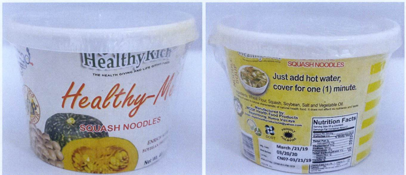
Figure 1. Unregistered HEALTHYRICH Healthy-Me Squash Noodle

The Food and Drug Administration (FDA) warns all healthcare professionals and the general public NOT TO PURCHASE AND CONSUME the following unregistered food products: