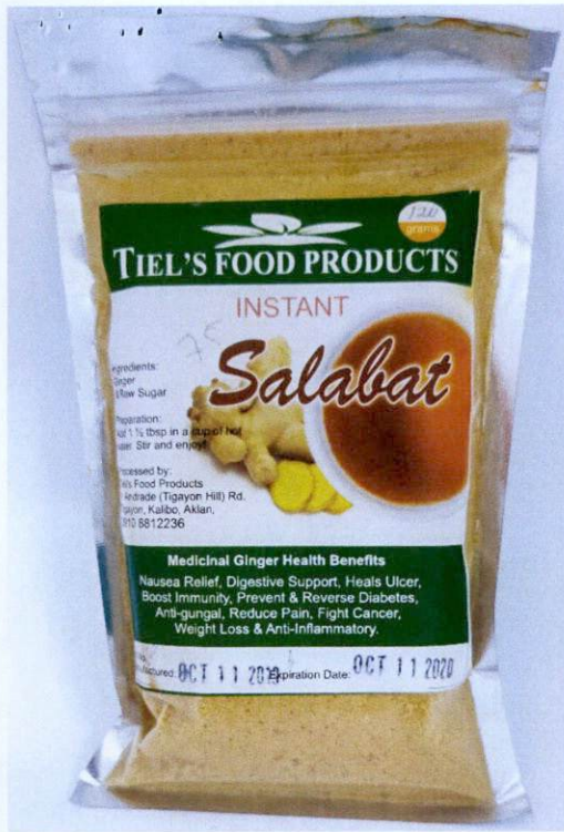
Figure 2. Unregistered TIEL'S FOOD PRODUCTS Instant Salabat