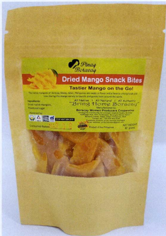
Figure 4. Unregistered PINAY BORACAY Dried Mango Snack Bites