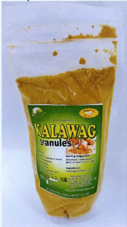
Figure 2. Unregistered KALAWAG GRANULES Kalawag and Turmeric Powder Food Supplement