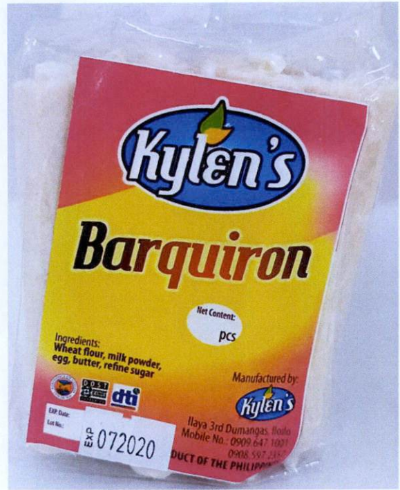
Figure 3. Unregistered KYLEN'S Barquiron