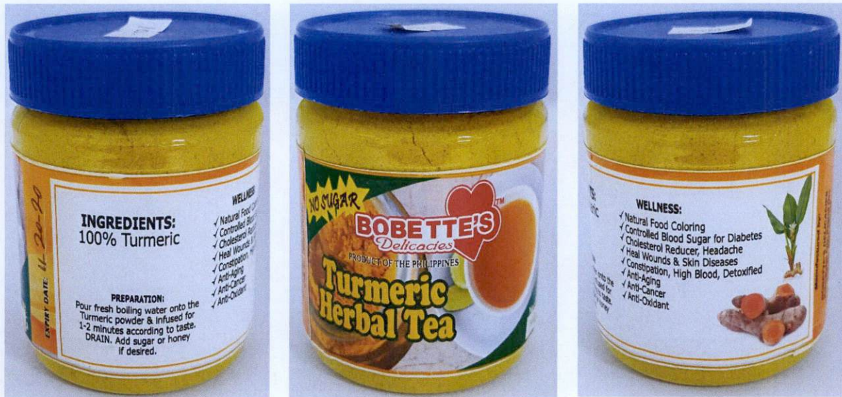
Figure 1. Unregistered BOBETTE'S DELICACIES Turmeric Herbal Tea

The Food and Drug Administration (FDA) warns all healthcare professionals and the general public NOT TO PURCHASE AND CONSUME the following unregistered food products: