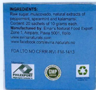
Figure 1. Unregistered EVINA NATURALS Mint Fresh Instant Herbal Tea