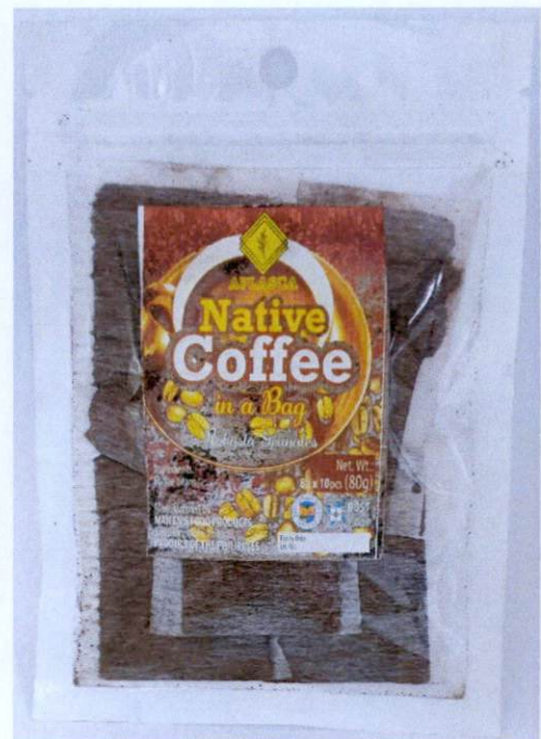
Figure 5. Unregistered APLASCA Native Coffee