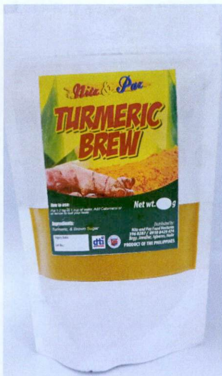
Figure 4. Unregistered NITZ & PAZ Turmeric Brew