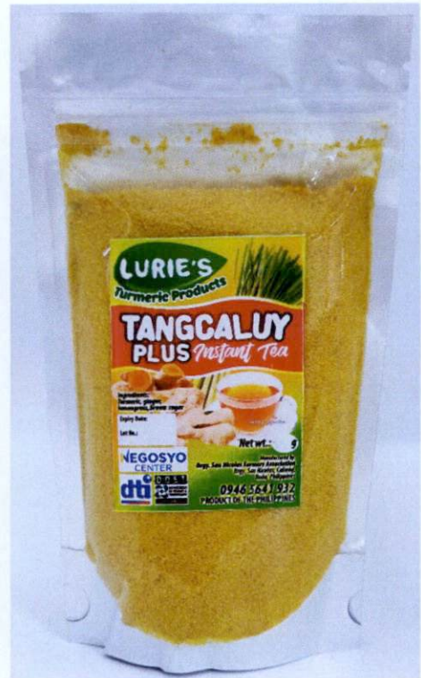
Figure 3. Unregistered LURIE'S TURMERIC PRODUCTS TANGCALUY PLUS Instant Tea