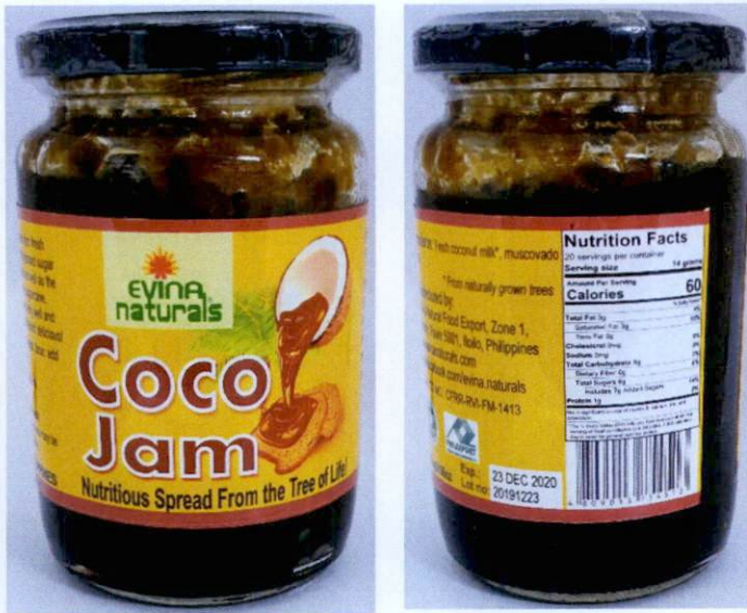
Figure 2. Unregistered EVINA NATURALS Coco Jam