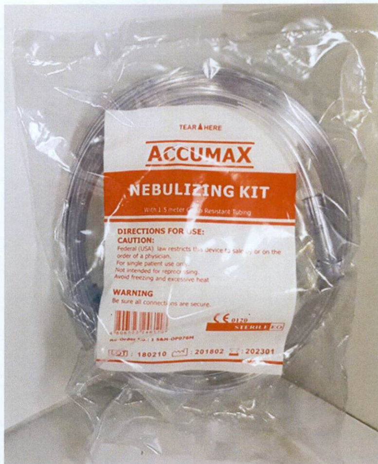
Figure 1. Unregistered Accumax Nebulizing Kit

The Food and Drug Administration (FDA) warns all healthcare professionals and the general public NOT TO PURCHASE AND USE the unregistered medical device product: