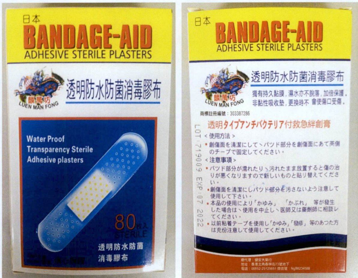
Figure 1. Unnotified Luen Man Fong Bandage-Aid Adhesive Sterile Plasters (In Foreign Characters)

The Food and Drug Administration (FDA) warns all healthcare professionals and the general public NOT TO PURCHASE AND USE the unnotified medical device product: