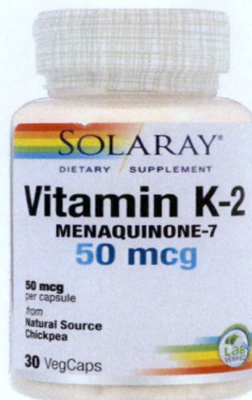
Figure 1. Unregistered SOLARAY Dietary Supplement Vitamin K-2 Menaquinone-7 50mcg VegCaps

The Food and Drug Administration (FDA) warns all healthcare professionals and the general public NOT TO PURCHASE AND CONSUME the following unregistered food Supplements: