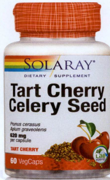
Figure 5. Unregistered SOLARAY Dietary Supplement Tart Cherry Celery Seed 620mg VegCaps