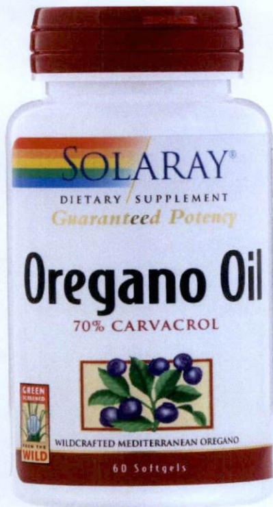
Figure 2. Unregistered SOLARAY Dietary Supplement Oregano Oil 70% Carvacrol Softgels