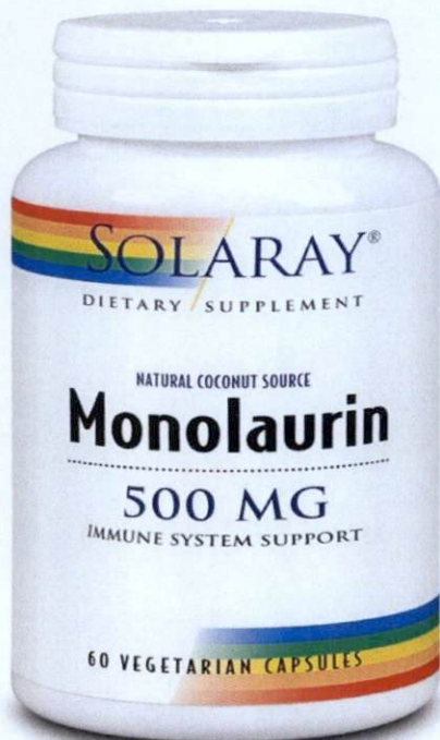
Figure 4. Unregistered SOLARAY Dietary Supplement Natural Coconut Source Monolaurin 500mg, Vegetarian Capsule