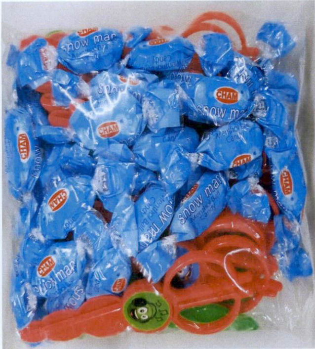
Figure 2. Unregistered CHAM SNOWMAN Menthol Ball Candy