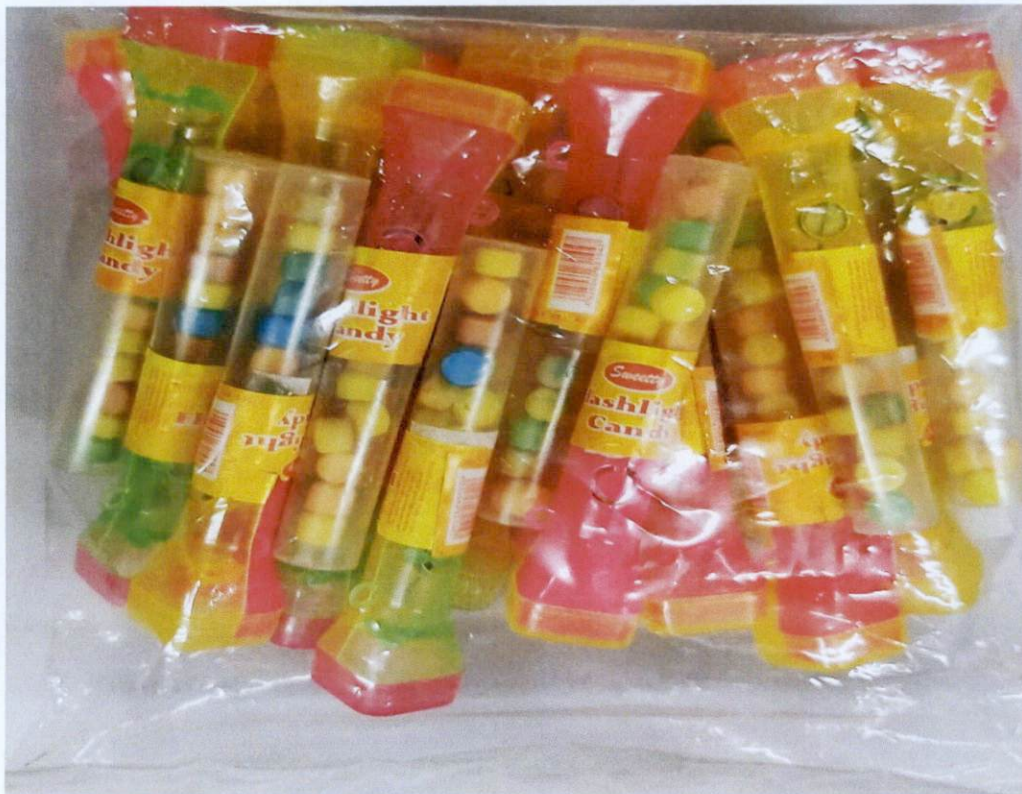
Figure 1. Unregistered SWEETTY Flashlight Candy

The Food and Drug Administration (FDA) warns all healthcare professionals and the general public NOT TO PURCHASE AND CONSUME the following unregistered food products: