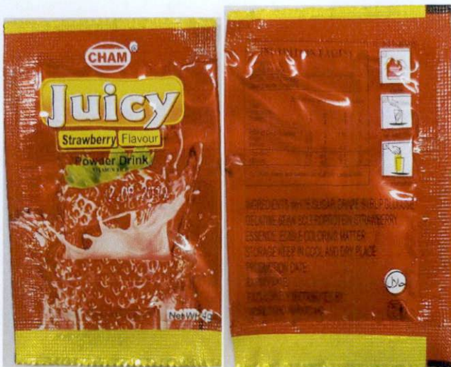
Figure 4. Unregistered CHAM JUICY Strawberry Flavour, Powder Drink, Vitamin Rich