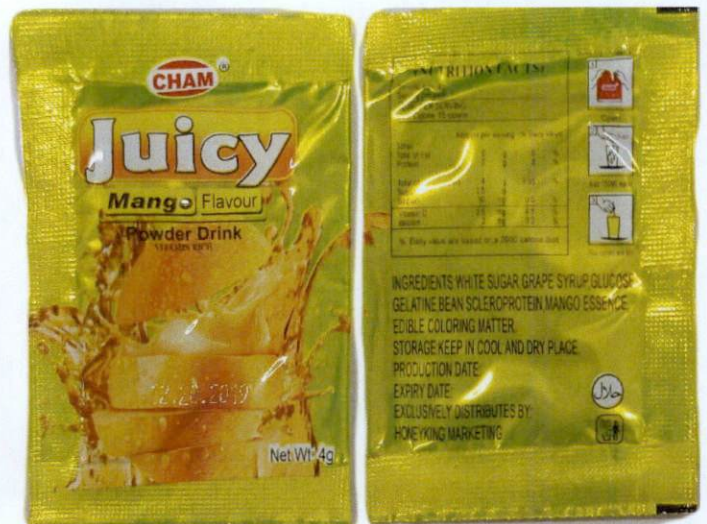
Figure 5. Unregistered CHAM JUICY Mango Flavour, Powder Drink, Vitamin Rich