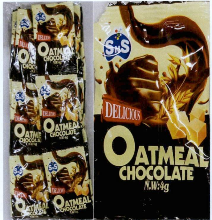
Figure 3. Unregistered SNS Delicious Oatmeal Chocolate