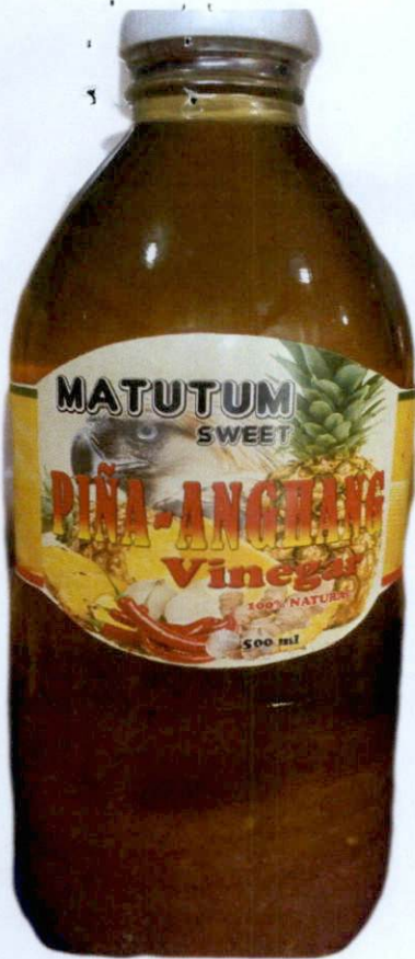
Figure 2. Unregistered MATUTUM SWEET Piña-Anghang Vinegar, 500ml