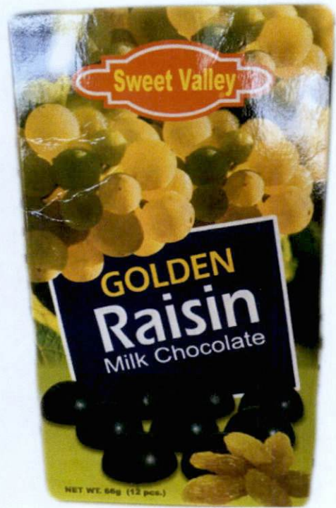
Figure 3. Unregistered SWEET VALLEY Golden Raisin Milk Chocolate, 66g, 12pcs