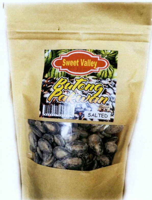
Figure 1. SWEET VALLEY Butong Pakwan, Salted

The Food and Drug Administration (FDA) warns all healthcare professionals and the general public NOT TO PURCHASE AND CONSUME the following unregistered food products: