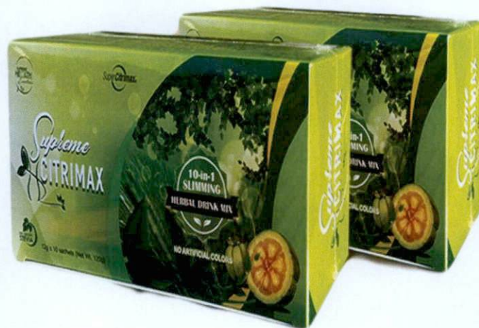
Figure 4. Unregistered SUPREME CITRIMAX 10-in1 Slimming Herbal Drink Mix