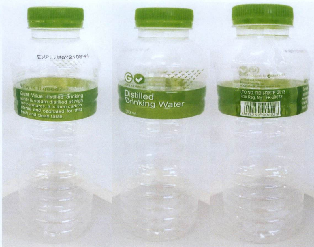
Figure 1. Unregistered GREAT VALUE Distilled Drinking Water, 350ml

The Food and Drug Administration (FDA) warns all healthcare professionals and the general public NOT TO PURCHASE AND CONSUME the following unregistered food products: