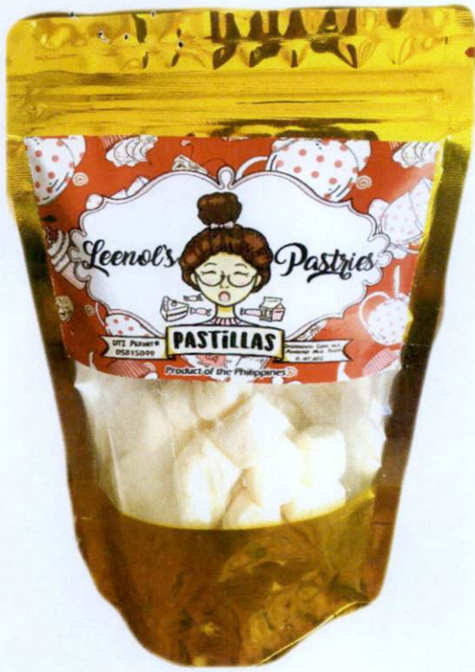
Figure 2. Unregistered LEENOL'S PASTRIES Pastillas