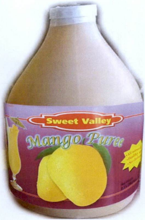
Figure 3. Unregistered SWEET VALLEY Mango Puree, 2.1 L