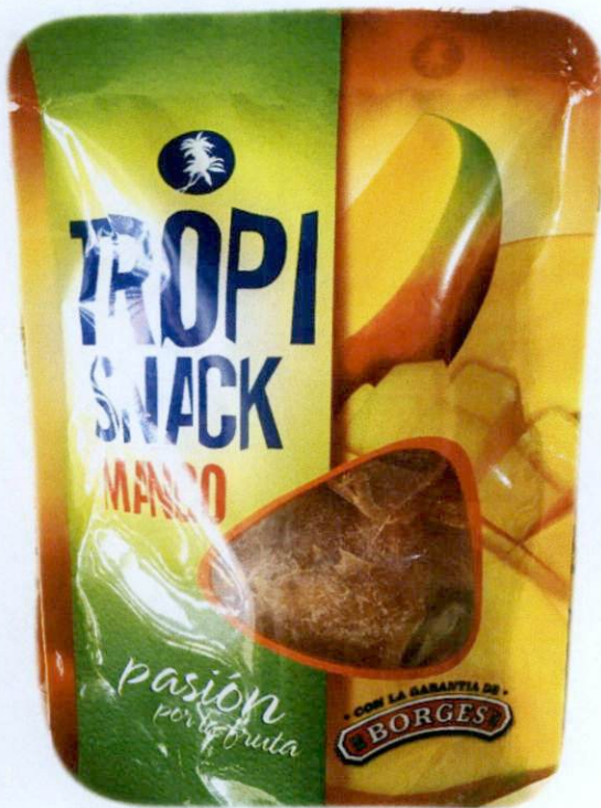
Figure 4. Unregistered TROPI SNACK Mango 75g