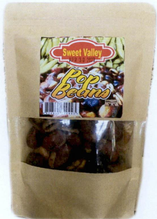
Figure 5. Unregistered SWEET VALLEY Pop Beans