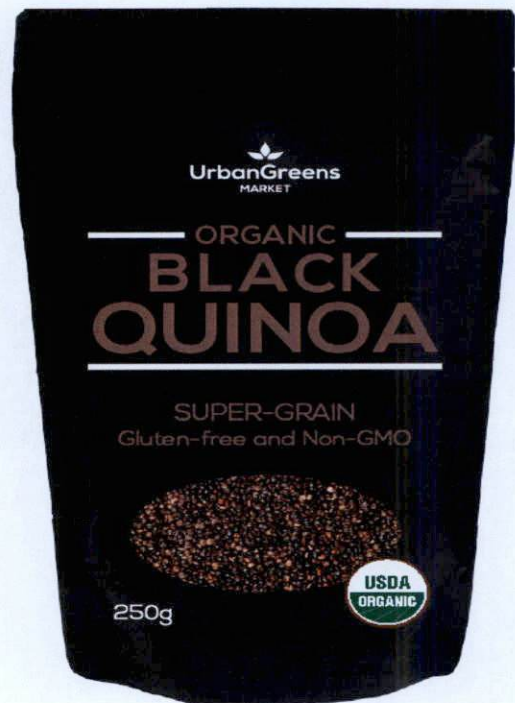
Figure 5. URBANGREENS MARKET Organic Black Quinoa, Super Grain Gluten Free and Non-GMO, 250g