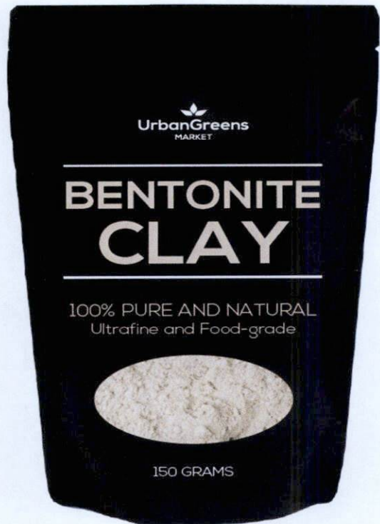
Figure 3. Unregistered URBANGREENS MARKET Bentonite Clay, 100% Pure and Natural Ultrafine and Food-grade, 150grams