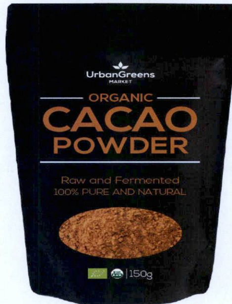
Figure 1. Unregistered URBANGREENS MARKET Organic Cacao Powder, Raw and Fermented 100% Pure and Natural, 150g

The Food and Drug Administration (FDA) warns all healthcare professionals and the general public NOT TO PURCHASE AND CONSUME the following unregistered food products