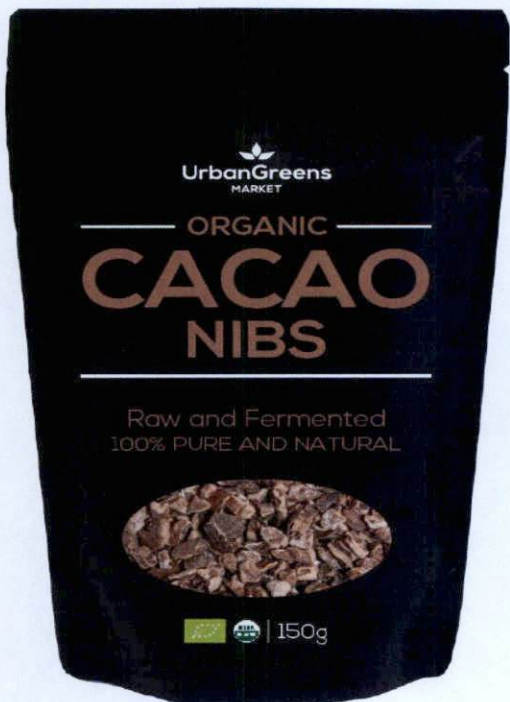
Figure 4. URBANGREENS MARKET Organic Cacao Nibs, Raw and Fermented 100% Pure and Natural, 150g