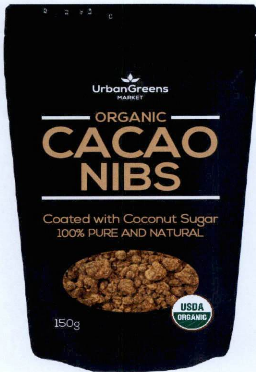
Figure 2. Unregistered URBANGREENS MARKET Organic Cacao Nibs, Coated with Coconut Sugar and 100% Pure and Natural, 150g