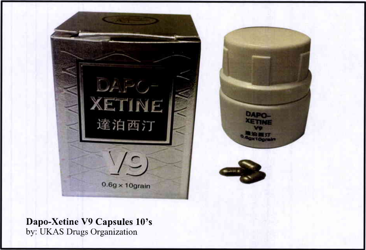
Figure 2. Unregistered drug product