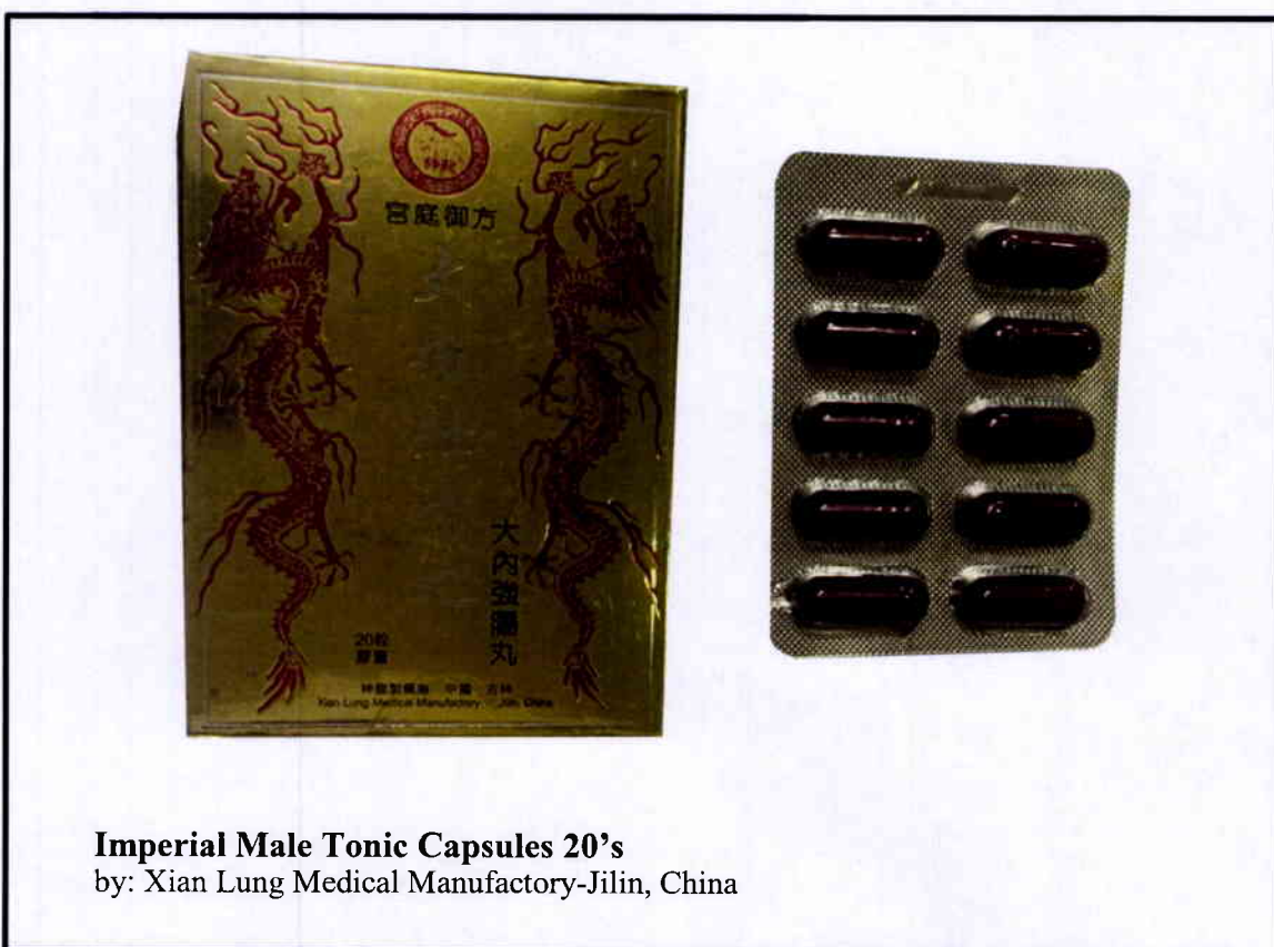
Figure 5. Unregistered drug product