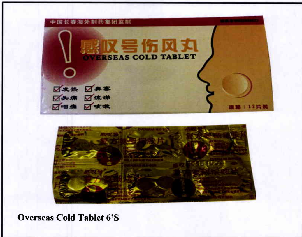
Overseas Cold Tablet 6'S

The Food and Drug Administration (FDA) advises the public against the purchase and use of the following unregistered drug products: