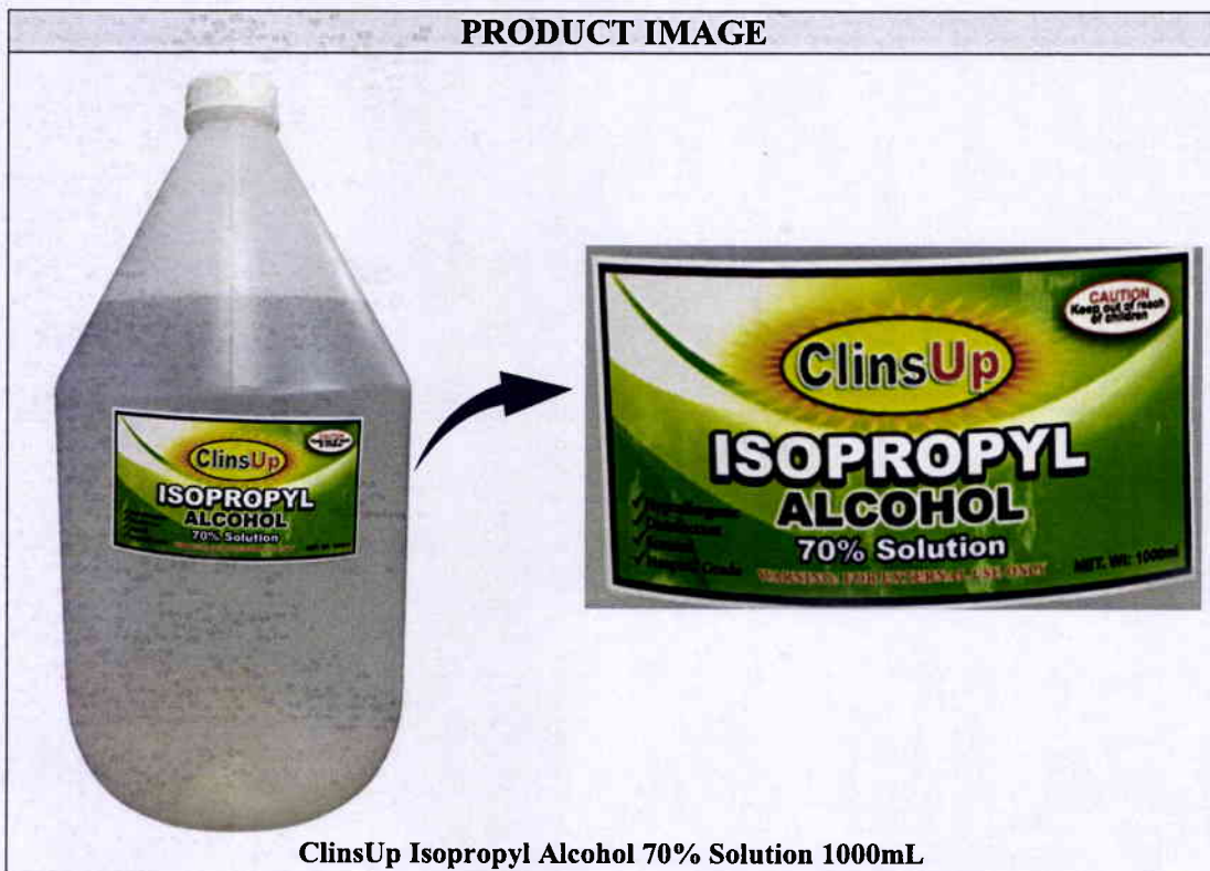
Figure 1. Adulterated, Misbranded, and Unregistered Health Product

The Food and Drug Administration (FDA) warns the public against the purchase and use of adulterated, misbranded, and unregistered health product which poses potential danger or injury to health: