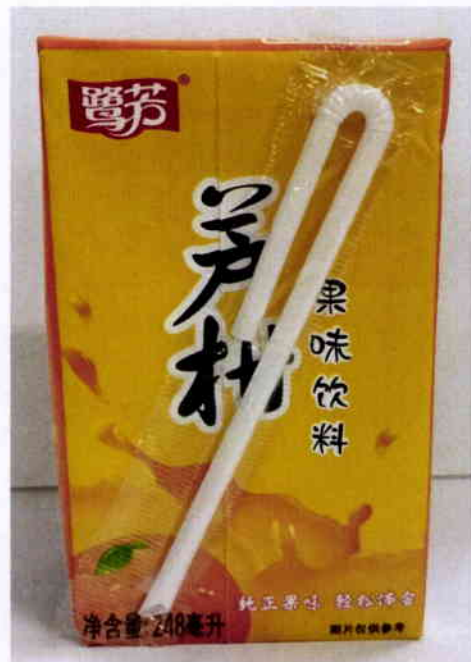
Figure 3. Unregistered Orange Juice Drink with Orange image on the lower left of the Information Panel (In Foreign Language)