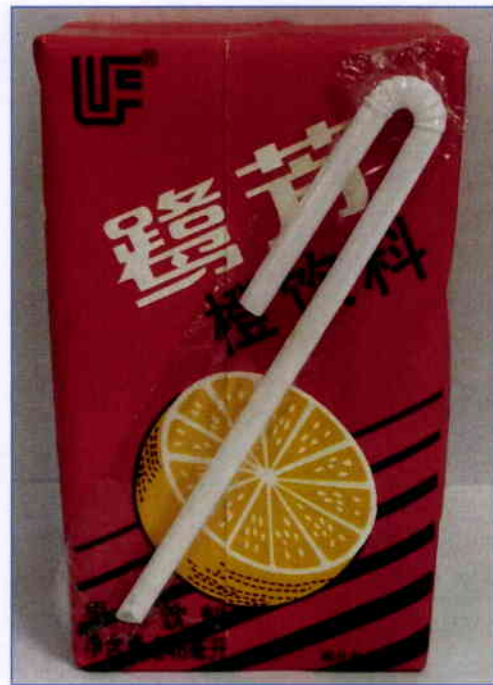
Figure 2. Unregistered LF Orange Drink with Half Orange image (In Foreign Language)