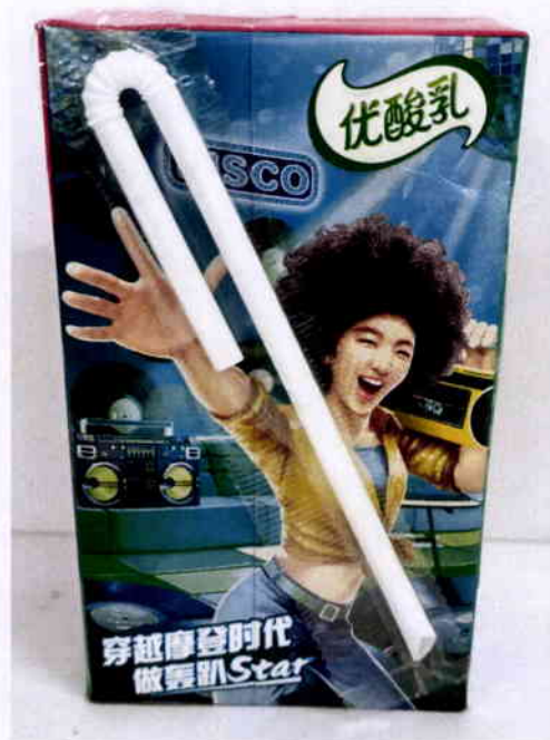
Figure 5. Unregistered STAR Strawberry Drink with Disco Woman image (In Foreign Language)