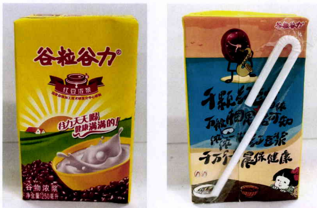
Figure 1. Unregistered SHENZEN TOP BRAND Liquid Drink with Red Mung Beans (In Foreign Language)

The Food and Drug Administration (FDA) warns all healthcare professionals and the general public NOT TO PURCHASE AND CONSUME the following unregistered food products: