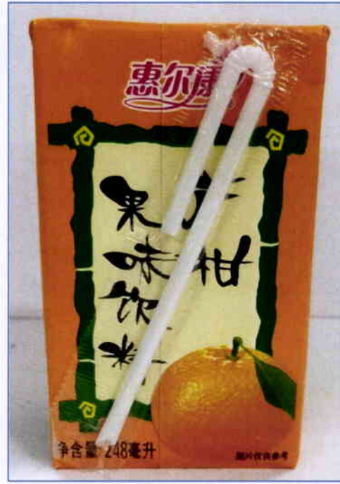
Figure 4. Unregistered Orange Juice Drink with Bamboo Frame image and Orange on the lower right side (In Foreign Language)