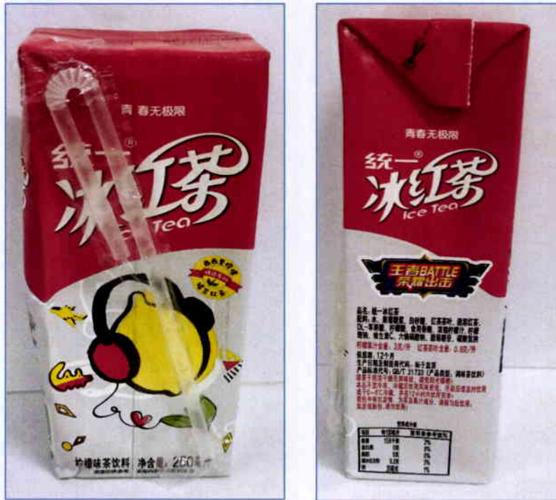
Figure 2. Unregistered Lemon Iced Tea Juice Drink with Lemon Image (In Foreign Language)