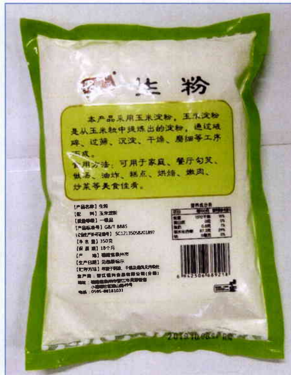
Figure 4. Unregistered YOU XIANG DAO White Fine Powder (In Foreign Language)