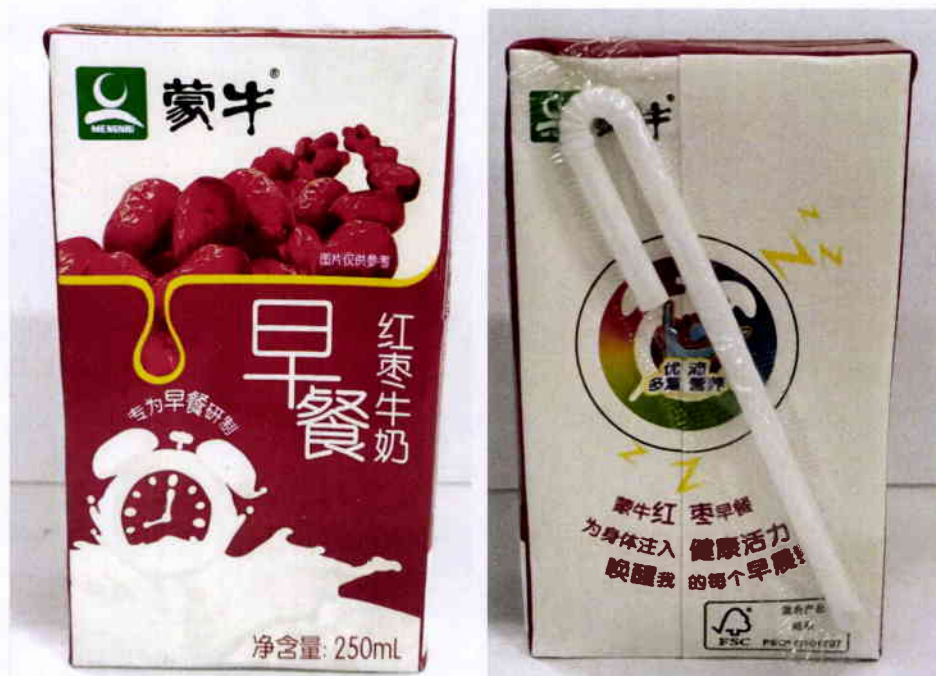
Figure 1. Unregistered MENGNUI Drink (In Foreign Language)

The Food and Drug Administration (FDA) warns all healthcare professionals and the general public NOT TO PURCHASE AND CONSUME the following unregistered food products: