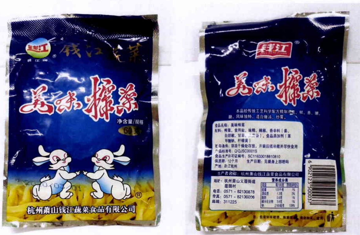
Figure 3. Unregistered QIAN JIANG Foods with Rabbit Image (In Foreign Language)