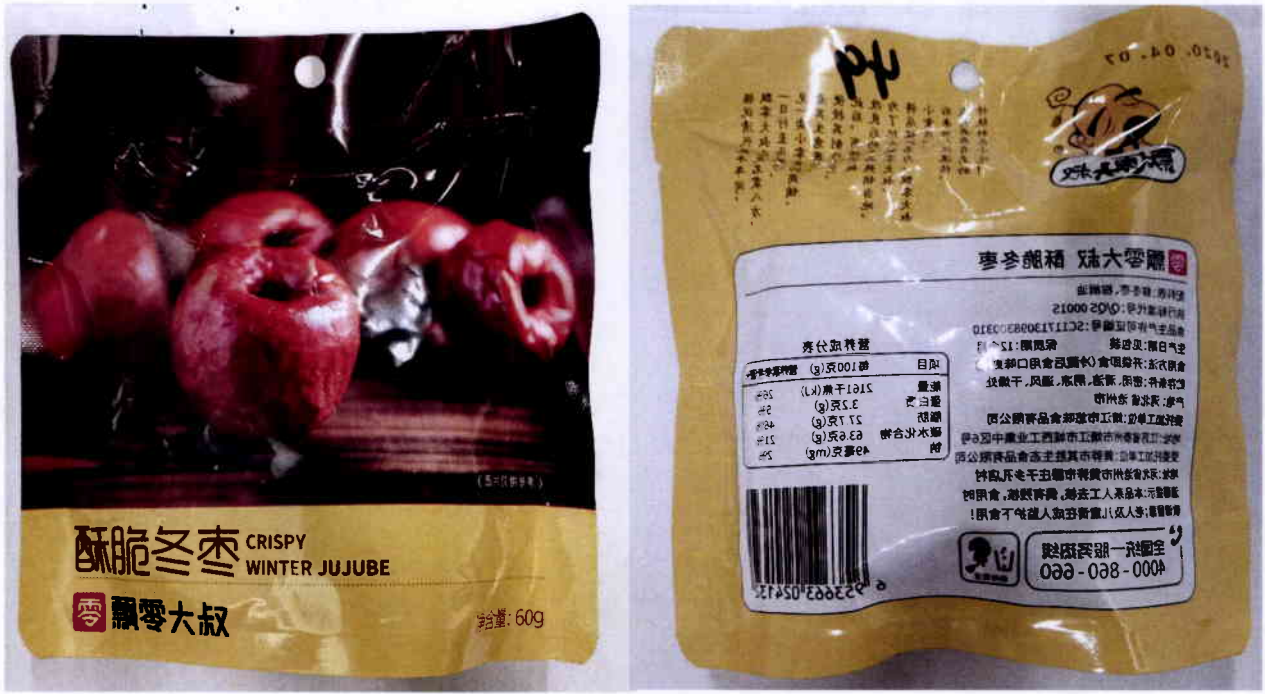
Figure 2. Unregistered Crispy Winter JuJube in Pouch (In Foreign Language)