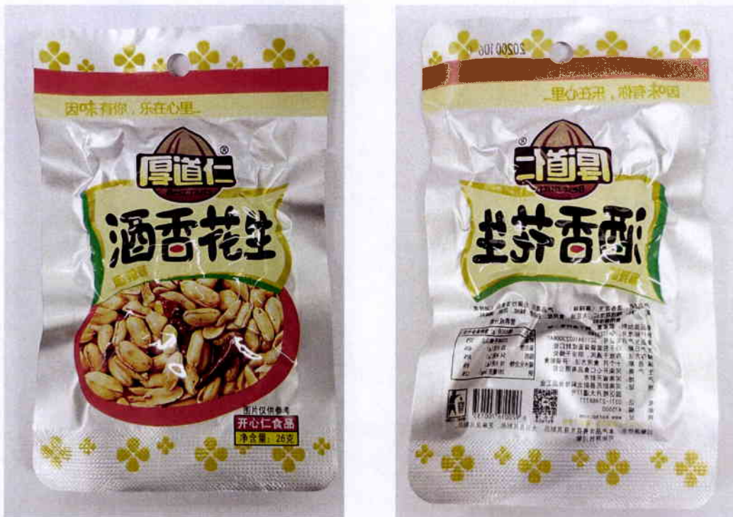
Figure 3. Unregistered BEST NUTS Peanuts with Chili in White Pouch Packaging (In Foreign Language)