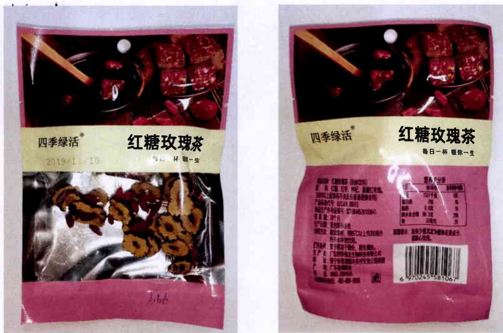
Figure 4. Unregistered Dried Jujube in Transparent Pink Pouch (In Foreign Language)