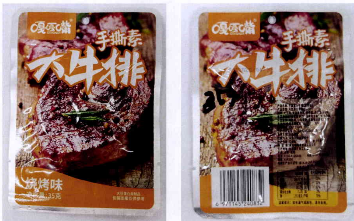
Figure 5. Unregistered GAGAZUI with Meat Image in Yellow Orange Vacuum Sealed Packaging (In Foreign Language)

The FDA verified through post-marketing surveillance that the abovementioned food products are not registered and no corresponding Certificates of Product Registration (CPR) have been