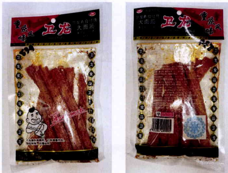
Figure 1. Unregistered LUOHE PINGPING CO. LTD., Preserved Meat Sticks in Clear Black and Red Packaging (In Foreign Language)

The Food and Drug Administration (FDA) warns all healthcare professionals and the general public NOT TO PURCHASE AND CONSUME the following unregistered food products: