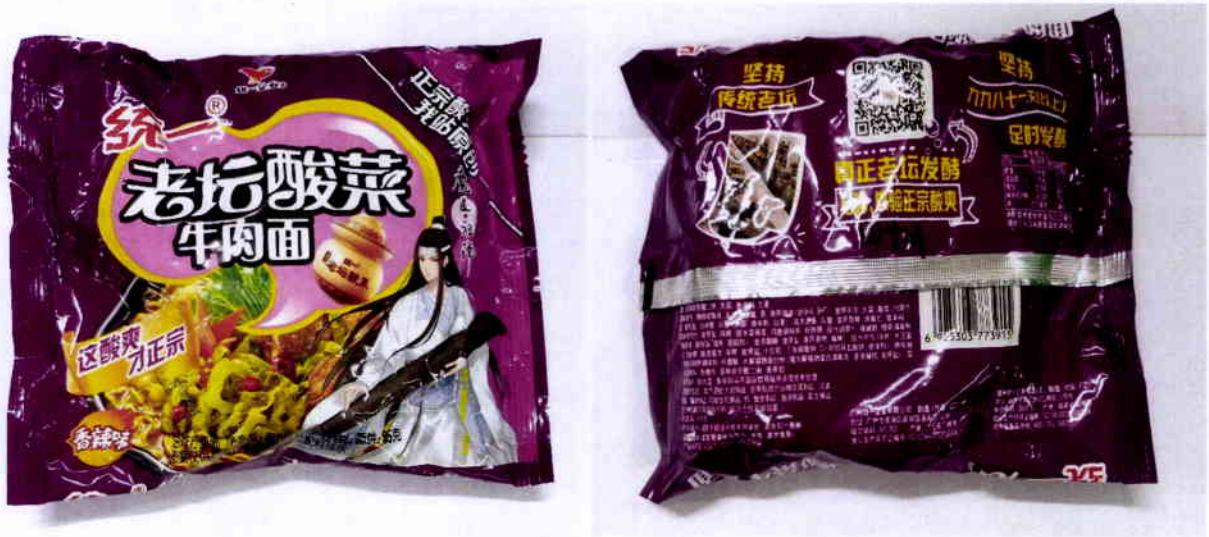
Figure 4. Unregistered Instant Noodles in Violet plastic pack (In Foreign Language)