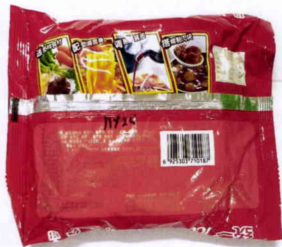
Figure 3. Unregistered Instant Noodles in Red plastic pack (In Foreign Language)