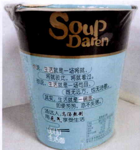
Figure 2. Unregistered SOUP DAREN Instant Cup Noodles in Sky blue packaging (In Foreign Language)