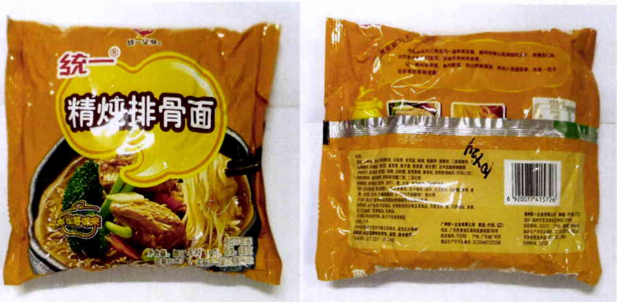
Figure 5. Unregistered Instant Noodles in Orange plastic pack (In Foreign Language)

The FDA verified through post-marketing surveillance that the abovementioned food products are not registered and no corresponding Certificates of Product Registration (CPR) have been issued. Pursuant to the Republic Act No. 9711, otherwise known as the “Food and Drug