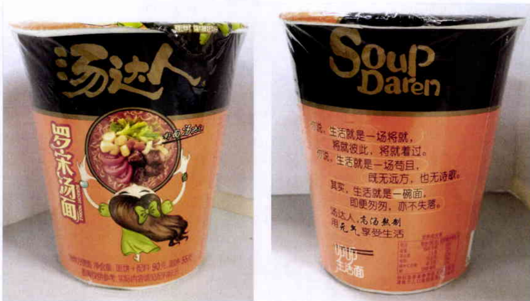
Figure 1. Unregistered SOUP DAREN Instant Cup Noodles in Orange and black packaging (In Foreign Language)

The Food and Drug Administration (FDA) warns all healthcare professionals and the general public NOT TO PURCHASE AND CONSUME the following unregistered food products: