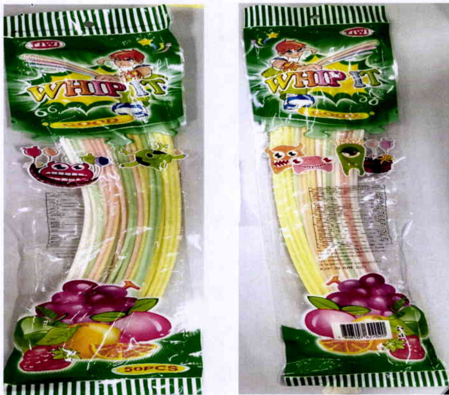
Figure 4. Unregistered TIWI Whip It Candy