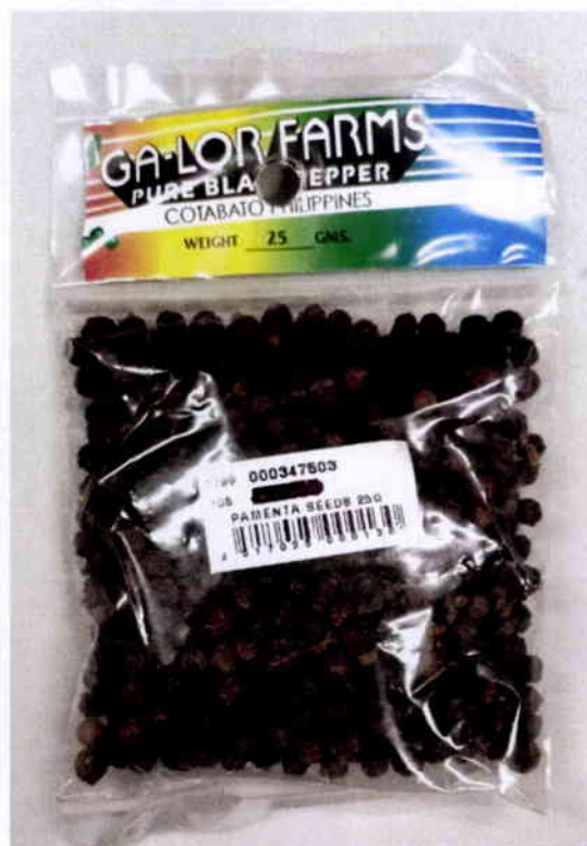
Figure 5. Unregistered GA-LOR FARMS Pure Black Pepper