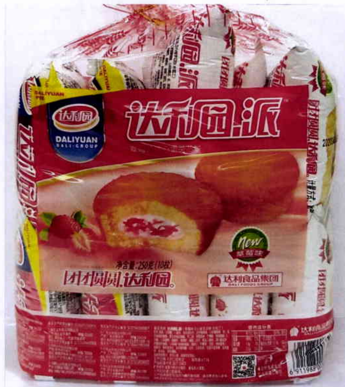
Figure 1. Unregistered DALIYUAN PIE Strawberry filling Cake (In Foreign Language)

The Food and Drug Administration (FDA) warns all healthcare professionals and the general public NOT TO PURCHASE AND CONSUME the following unregistered food products: