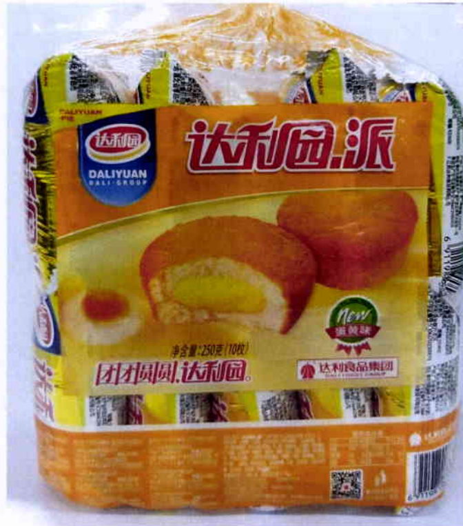
Figure 2. Unregistered DALIYUAN PIE Yolk filling Cake (In Foreign Language)