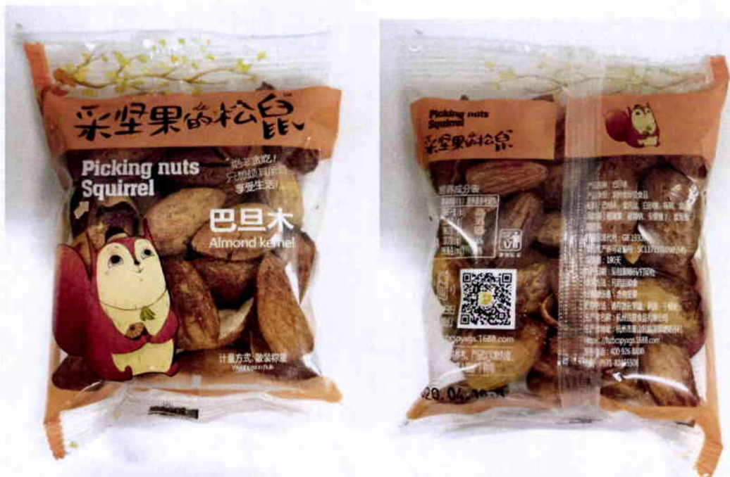
Figure 3. Unregistered PICKING NUTS SQUIRREL Almond Kernels (In Foreign Language)