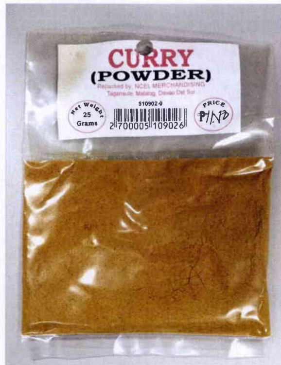
Figure 1. Unregistered NCEL MERCHANDISING Curry Powder

The Food and Drug Administration (FDA) warns all healthcare professionals and the general public NOT TO PURCHASE AND CONSUME the following unregistered food products: