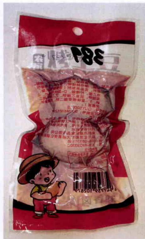
Figure 5. Unregistered Preserved Potato in Red Vacuum Packaging with Child Farmer Image (In Foreign Language)