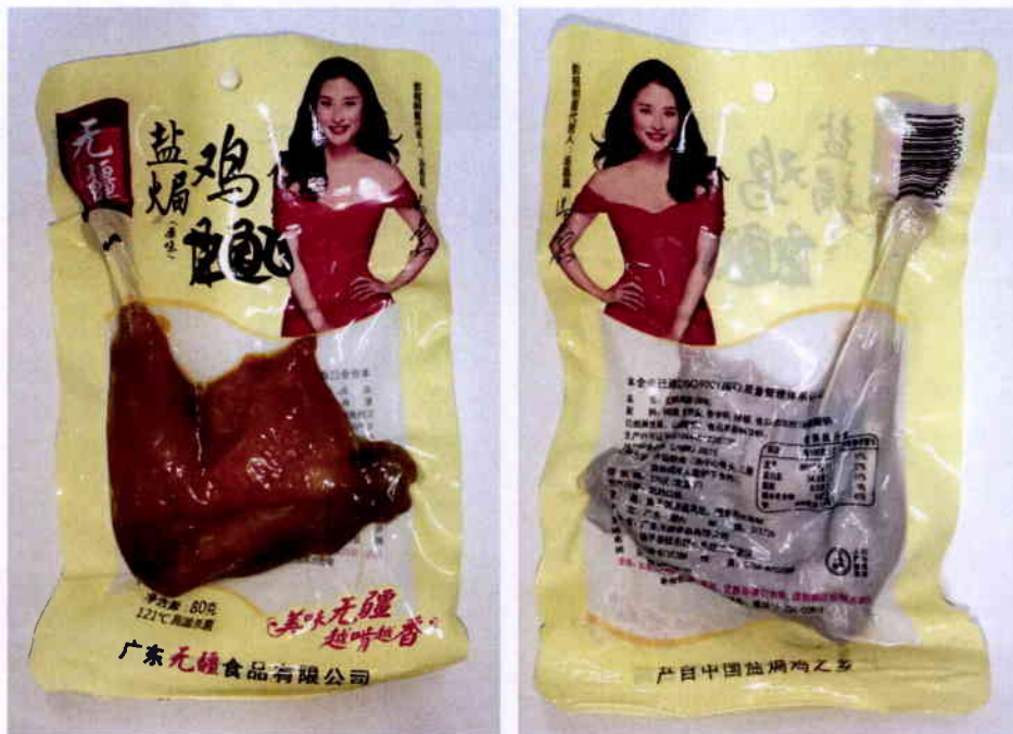
Figure 3. Unregistered WUJIANG FOOD Preserved Chicken Part in White and Yellow Packaging (In Foreign Language)