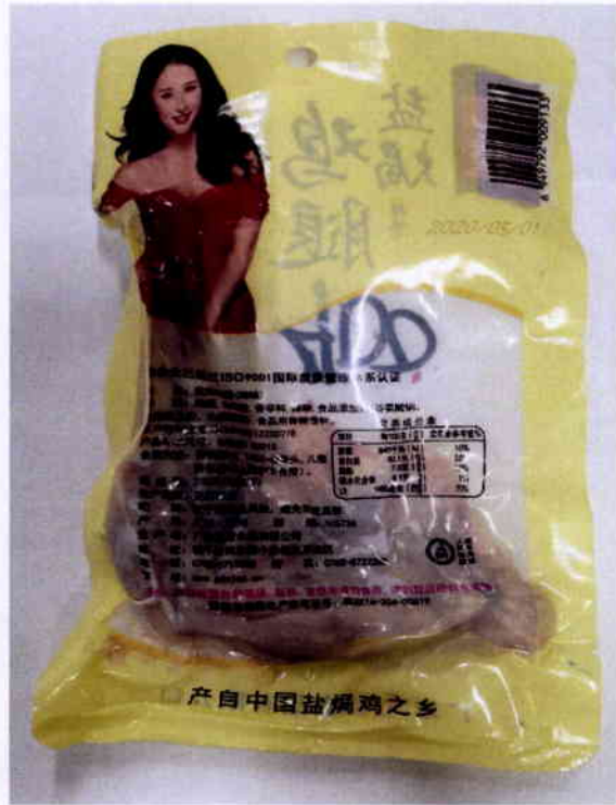
Figure 4. Unregistered WUJIANG FOOD Preserved Chicken Part in Yellow with Red dash Packaging (In Foreign Language)