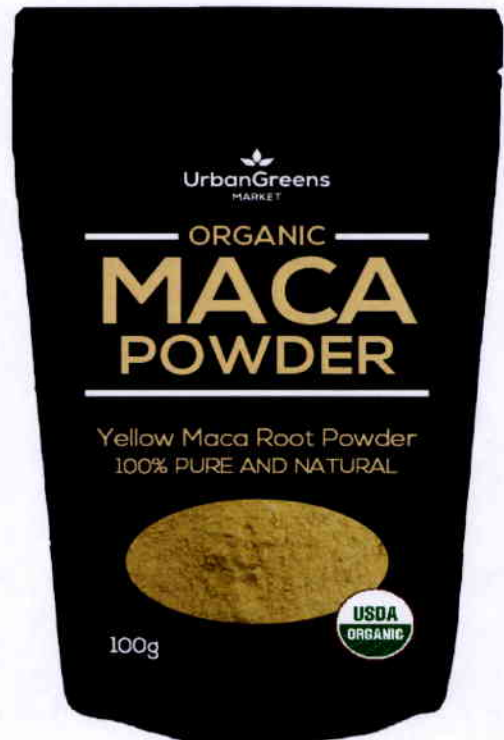
Figure 3. Unregistered URBANGREENS MARKET Organic Maca Powder, Whole Root Powder, 100% Pure and Natural, 100g