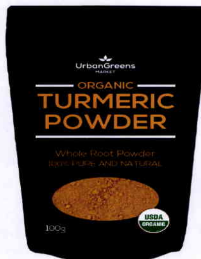
Figure 1. Unregistered URBANGREENS MARKET Organic, Turmeric Powder, Whole Root Powder, 100% Pure and Natural, 100g

The Food and Drug Administration (FDA) warns all healthcare professionals and the general public NOT TO PURCHASE AND CONSUME the following unregistered food products: