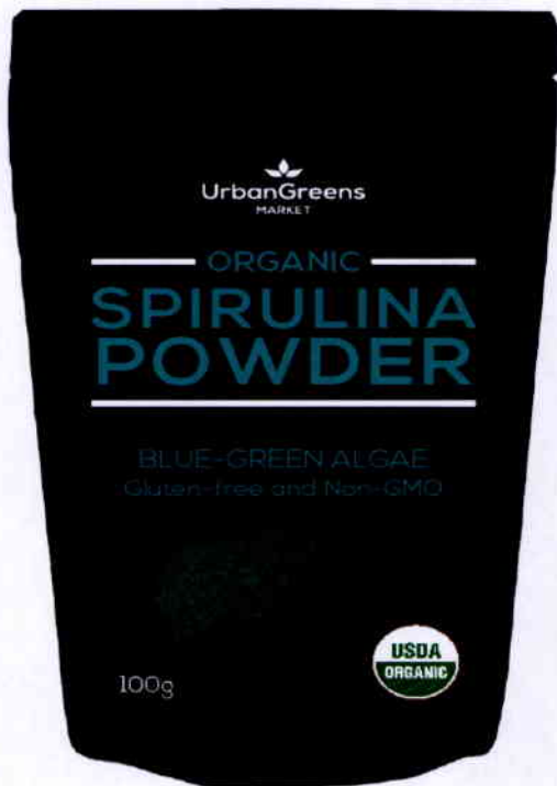
Figure 2. Unregistered URBANGREENS MARKET Organic Spirulina Powder, Blue Green Algae Gluten Free and Non GMO, 100g