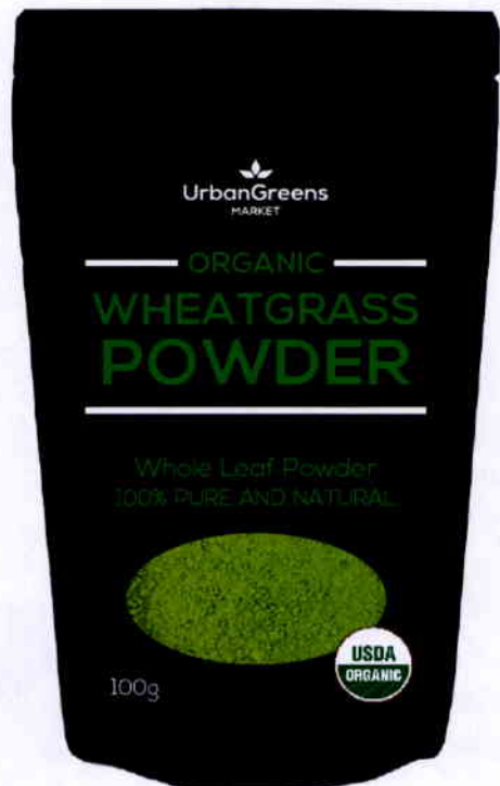
Figure 5. URBANGREENS MARKET Organic Wheatgrass Powder, Whole Leaf Powder 100% Pure and Natural,