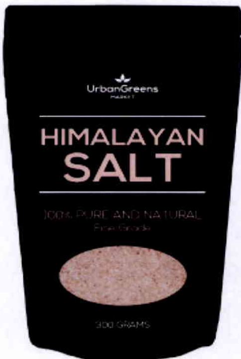
Figure 4. Unregistered URBANGREENS MARKET Himalayan Salt, 100% Pure and Natural, Fine Grade