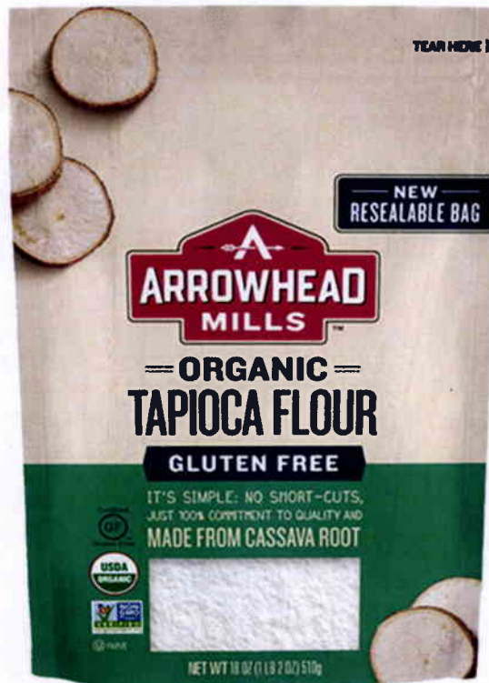
Figure 4. Unregistered ARROWHEAD MILLS Organic Tapioca Flour, 510g