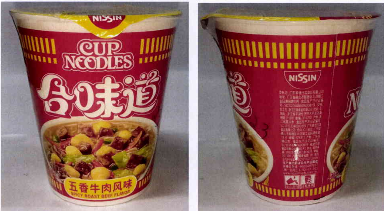
Figure 3. Unregistered NISSIN CUP NOODLES Spicy Roast Beef Flavor (In Foreign Language)