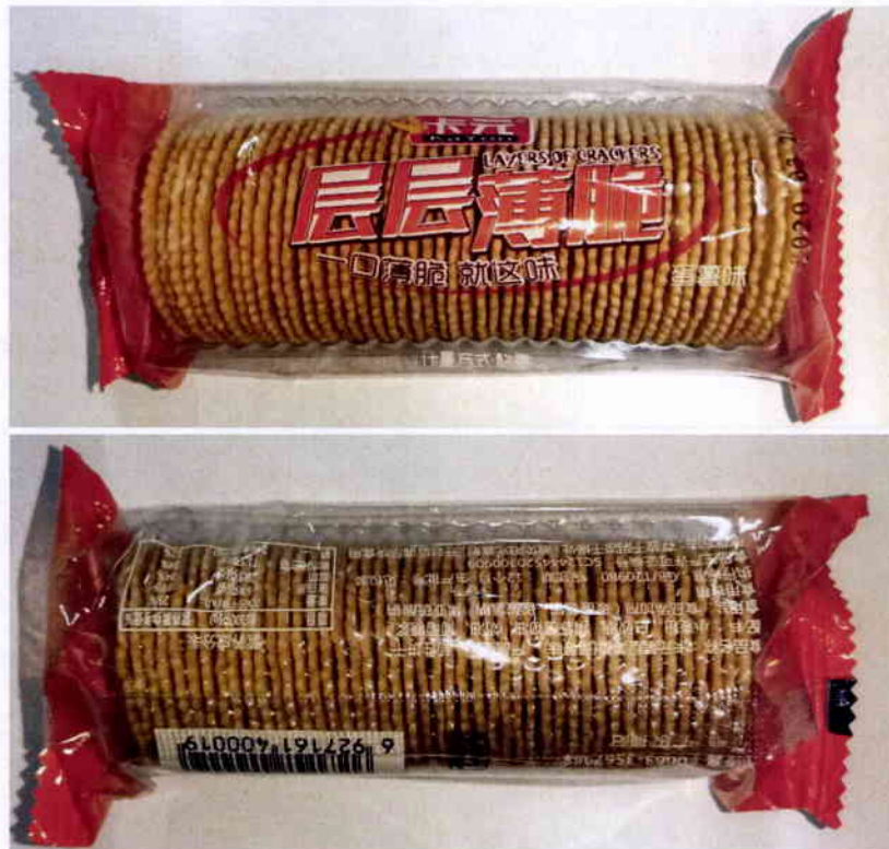
Figure 1. Unregistered KAYON Layers of Crackers in Transparent Packaging with Orange Lining (In Foreign Language)

The Food and Drug Administration (FDA) warns all healthcare professionals and the general public NOT TO PURCHASE AND CONSUME the following unregistered food products: