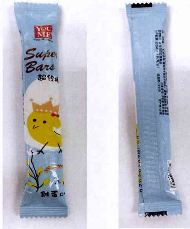
Figure 2. Unregistered YOU & ME Super Bars in Light Blue Packaging (In Foreign Language)