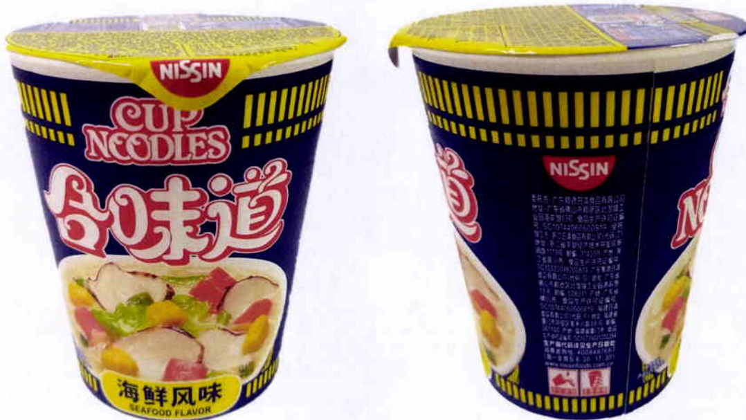
Figure 5. Unregistered NISSIN CUP NOODLES Seafood Flavor (In Foreign Language)

The FDA verified through post-marketing surveillance that the abovementioned food products are not registered and no corresponding Certificates of Product Registration (CPR) have been issued. Pursuant to the Republic Act No. 9711, otherwise known as the “Food and Drug Administration Act of 2009”, the manufacture, importation, exportation, sale, offering for sale,