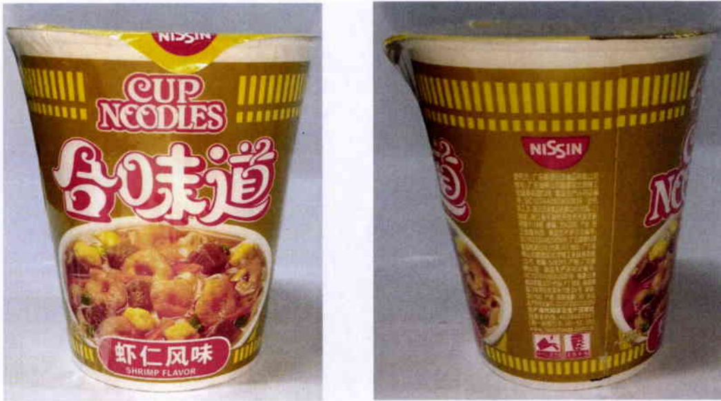
Figure 4. Unregistered NISSIN CUP NOODLES Shrimp Flavor (In Foreign Language)