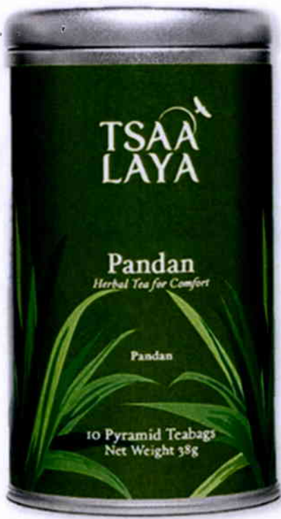
Figure 2. Unregistered TSAA LAYA Pandan Canister