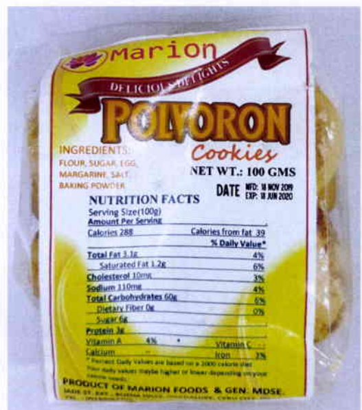
Figure 5. Unregistered MARION Polvoron Cookies