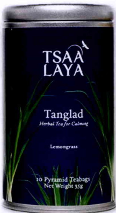
Figure 4. Unregistered TSAA LAYA Tanglad Canister