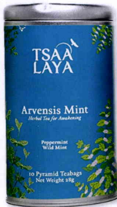
Figure 1. Unregistered TSAA LAYA Arvensis Mint Canister

The Food and Drug Administration (FDA) warns all healthcare professionals and the general public NOT TO PURCHASE AND CONSUME the following unregistered food products: