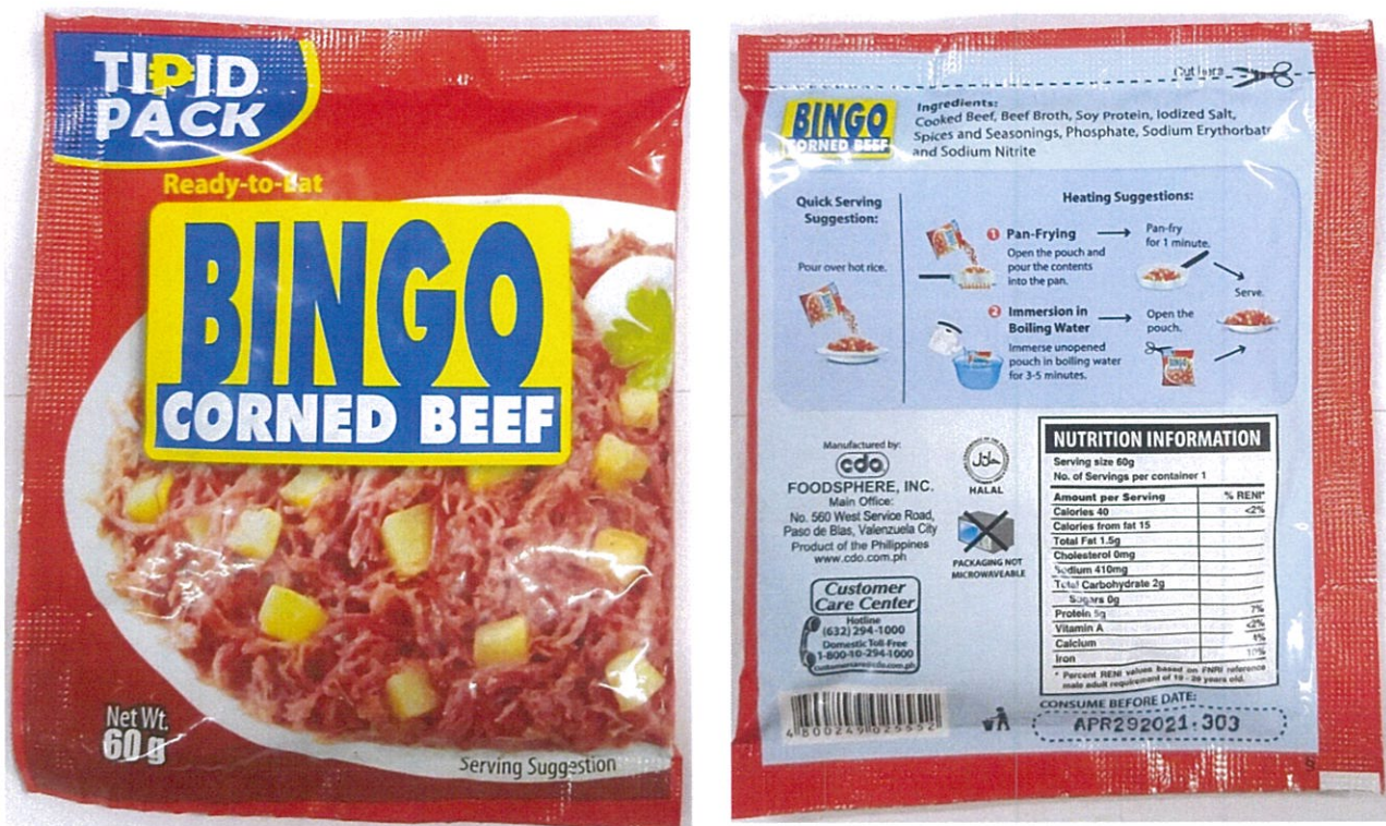
Figure 1. Registered Bingo Corned Beef Tipid Pack Ready to Eat

The Food and Drug Administration (FDA) informs the public that the food product BINGO Corned Beef Tipid Pack Ready to Eat is registered by the Market Authorization Holder, CDO FOODSPHERE INC. , under the National Meat Inspector Service (NMIS).