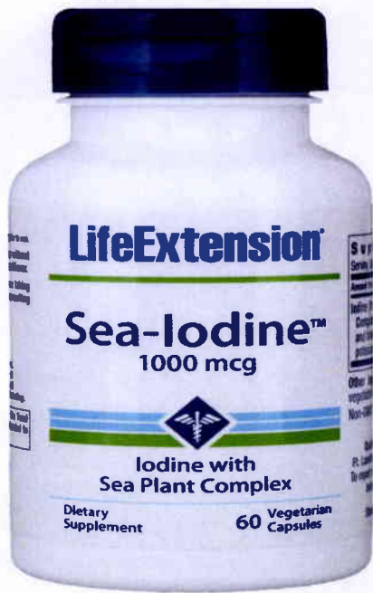
Figure 2. Unregistered LIFE EXTENSION Sea-Iodine 1000mcg with Sea Plant Complex Dietary Supplement, 60 Vegetarian Capsules