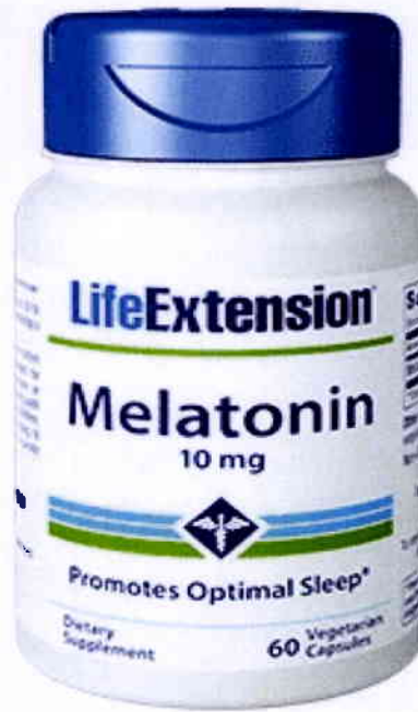
Figure 3. Unregistered LIFE EXTENSION Melatonin 10mg – Promotes Optimal Sleep Dietary Supplement, 60 Vegetarian Capsules