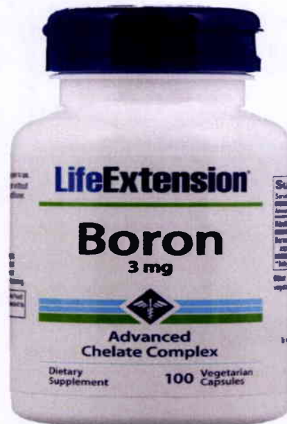
Figure 1. Unregistered LIFE EXTENSION Boron 3mg – Advance Chelate Complex Dietary Supplement, 100 Vegetarian Capsules

The Food and Drug Administration (FDA) warns all healthcare professionals and the general public NOT TO PURCHASE AND CONSUME the following unregistered food Supplements: