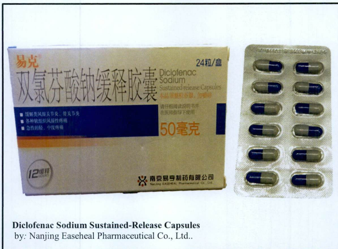
Diclofenac Sodium Sustained-Release Capsules by: Nanjing Easeheal Pharmaceutical Co., Ltd..